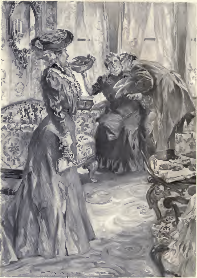
Feuerstein kissed her on the hang of her cheek Page 77