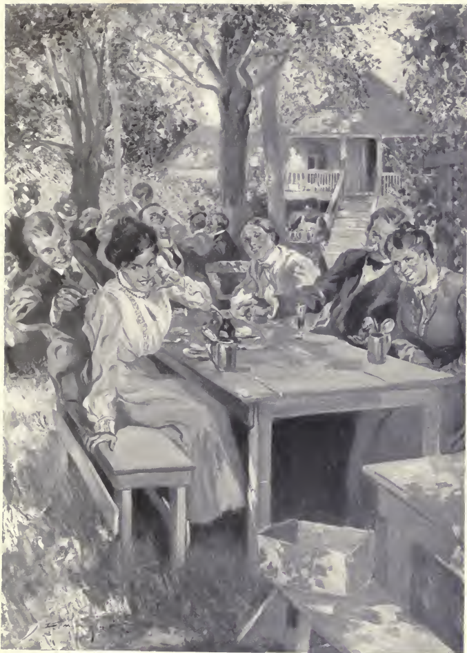
They lunched under the trees