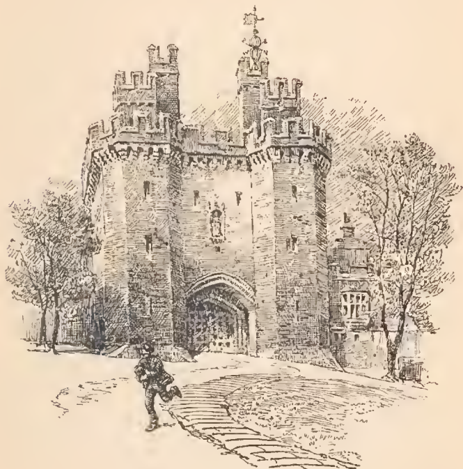
THE GATEWAY, LANCASTER CASTLE

‘It happened during the probationary period