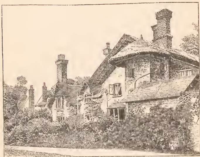
SHEEN LODGE, RICHMOND PARK

strains, I stole down into the garden. Day was grayly dawning in the north-east, and some light clouds floating across a pearly sky. The nightingales were sending forth interrupted capricious carols from every bush; with a higher treble for some unknown warblers, and a lower one for