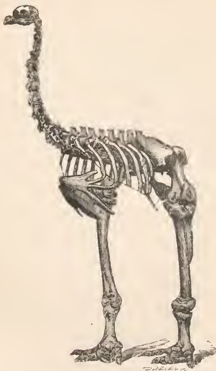
DINORNIS (PACHYORNIS) ELEPHANTOPUS, OWEN

‘The confirmatory response, anxiously expected