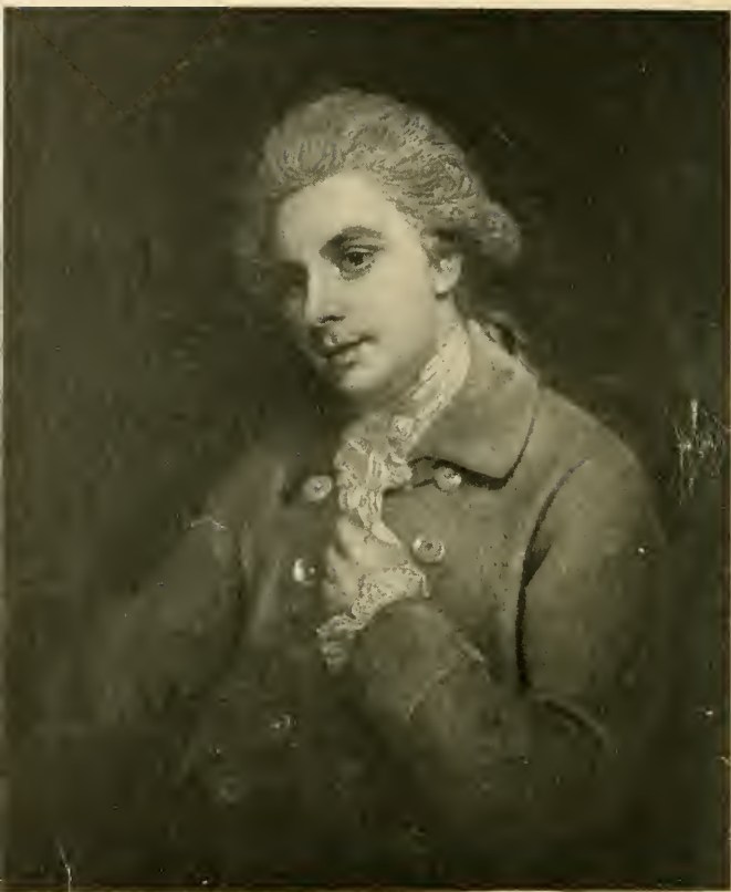
RICHARD BRINSLEY SHERIDAN