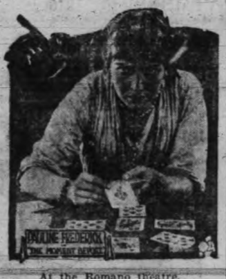
At the Romano theatre.

H. O. KIRKHAM & CO., LTD. Victoria, B. C. Duncan, B. C. PHONES: Grocery, 178 and 179. Delivery, 5522 Fish and Provisions, 5520. Meat, 5521