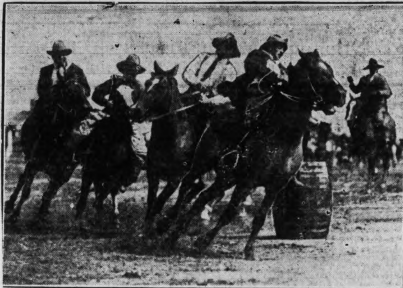
ALBERTA RANGERS rounding a corner in the cowboy barrel race, in preparation for the forthcoming Calgary stampede.