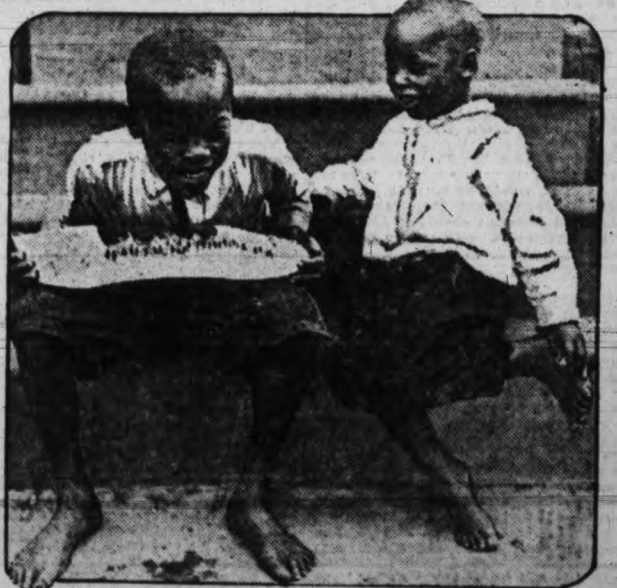
AIN'T GOIN' TO BE NO RINE! —Little brudder, yo' might 's well move on. This am de fust melon ob de season what's come to dis pickaninny an' I spects to eat it all.