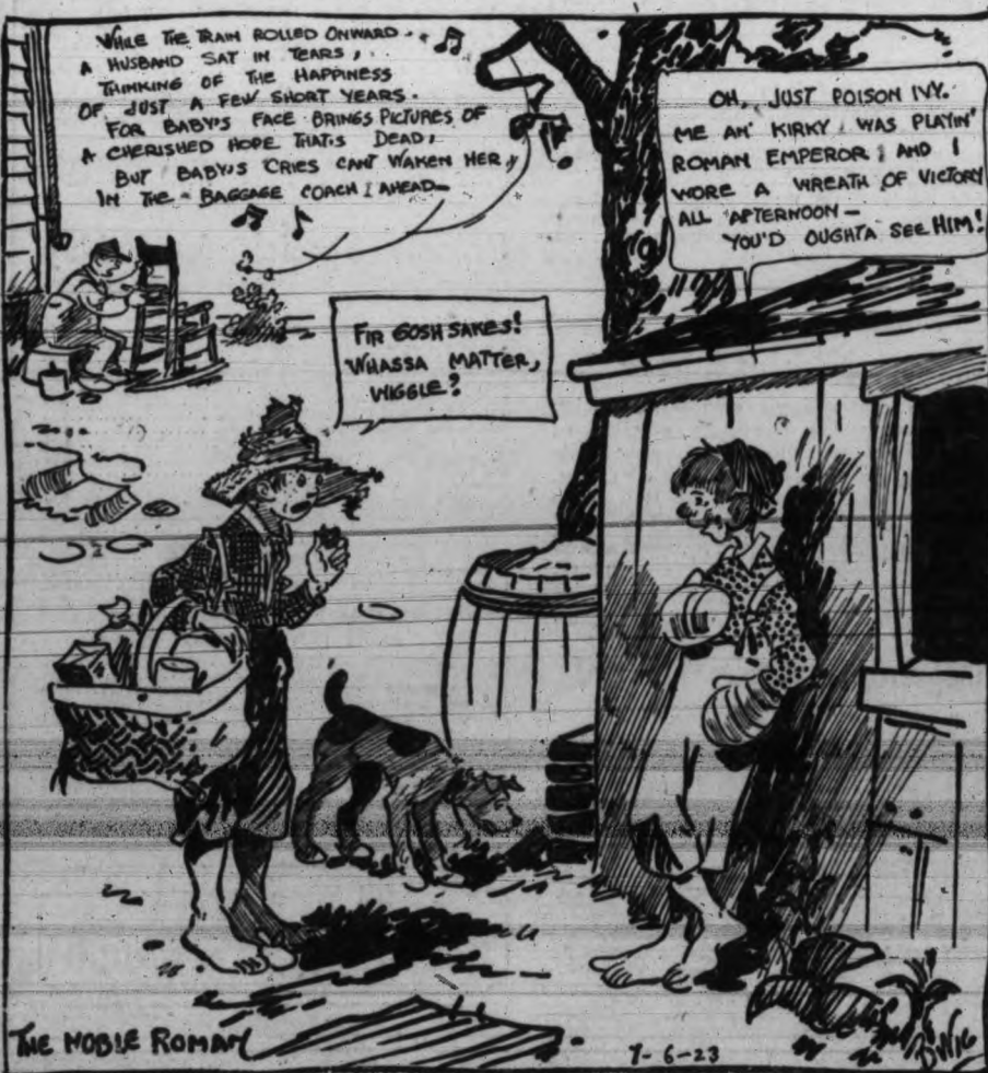
THE MODIE ROMAN 7-6-23