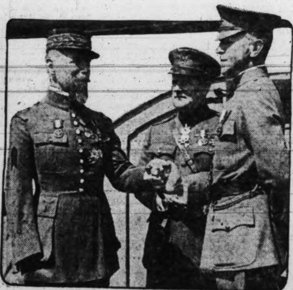
"ARGONNE LION" ARRIVES. —General Henri J. E. Gouraud, empty-sleeved "Lion of the Argonne," is greeted by General Bullard and General H. J. Reilly (rear) as he arrives in New York. General Gouraud will be a guest at the Rainbow Division reunion at Indianapolis, July 12. Before he returns to France he will visit every state represented in the division which he commanded.