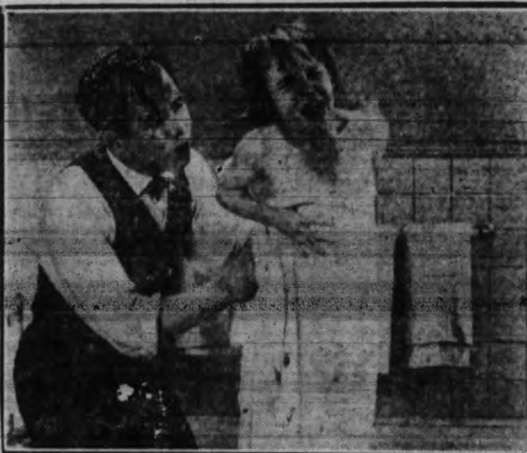
THEY MUST HAVE CHANGED. —No matter how cold the water is every boy loves to take his bath. Jackie Coogan proves that he is just the same as all regular boys.