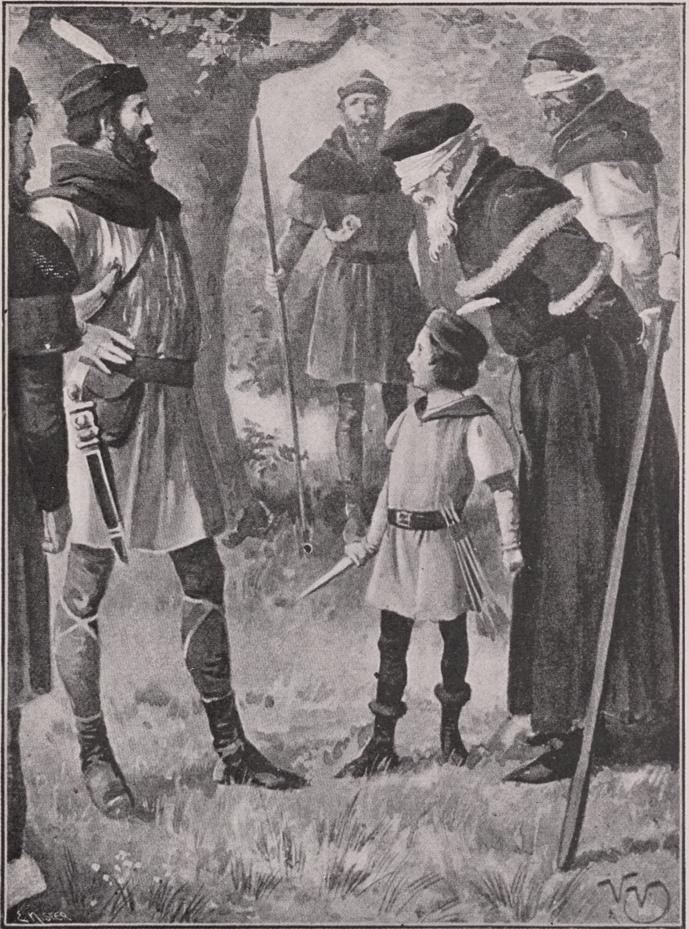
Robin looked fiercely round at the astonished men, as he drew the dagger which hung from his belt.