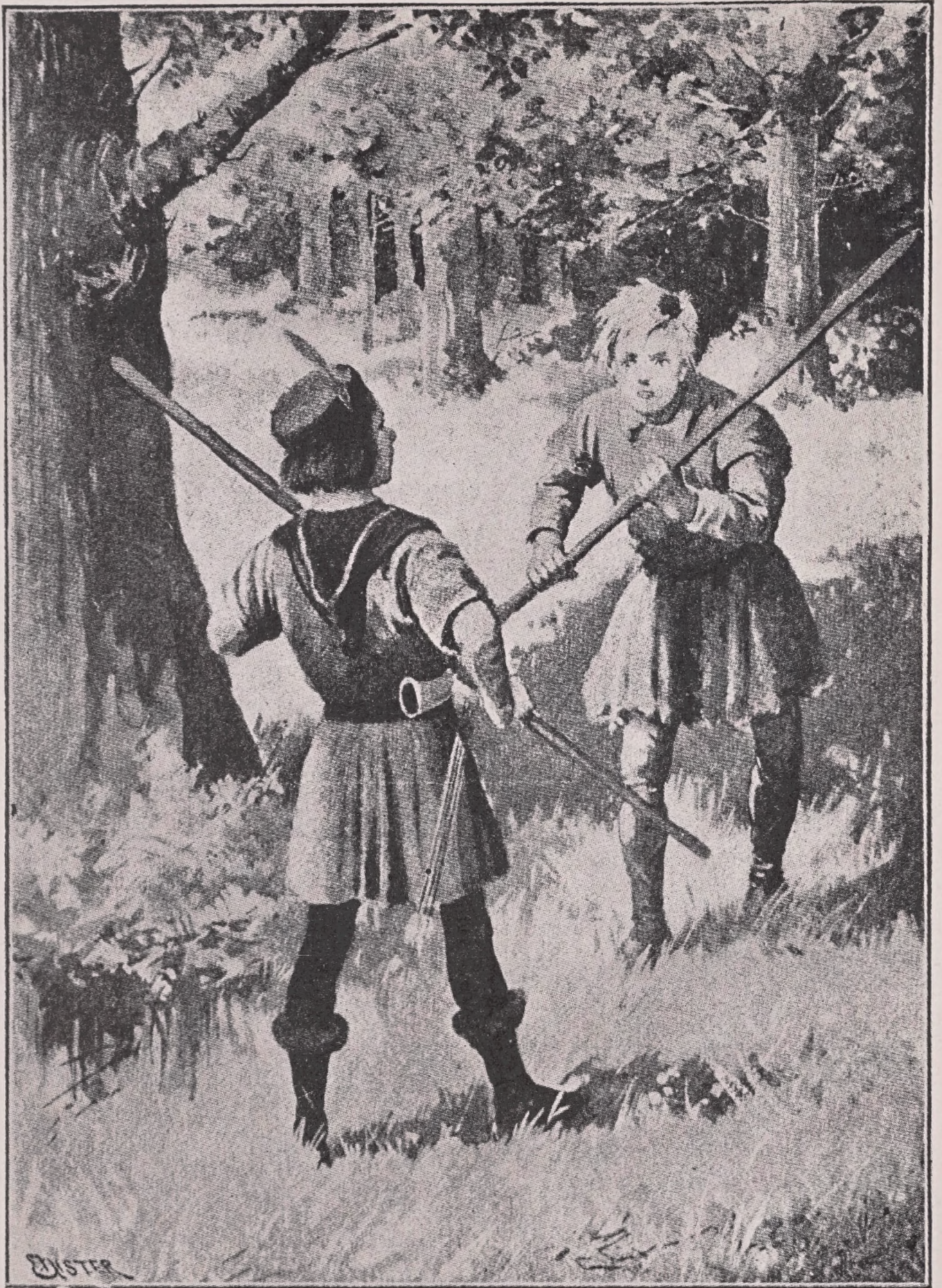
Robin faced round and stood on guard as he had been taught.