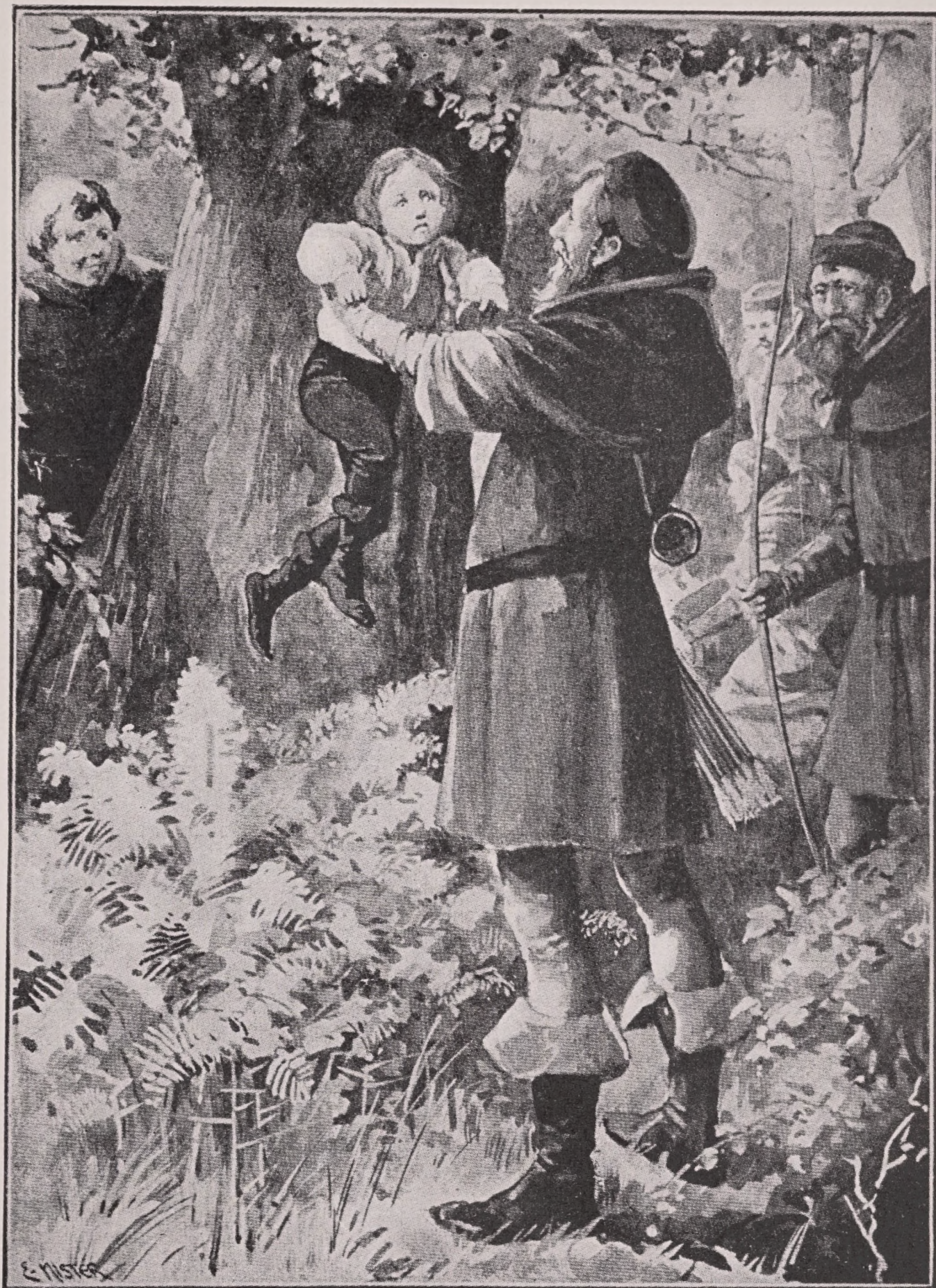
Robin ran into the arms of a huge fellow, who caught him up as if he had been a baby.