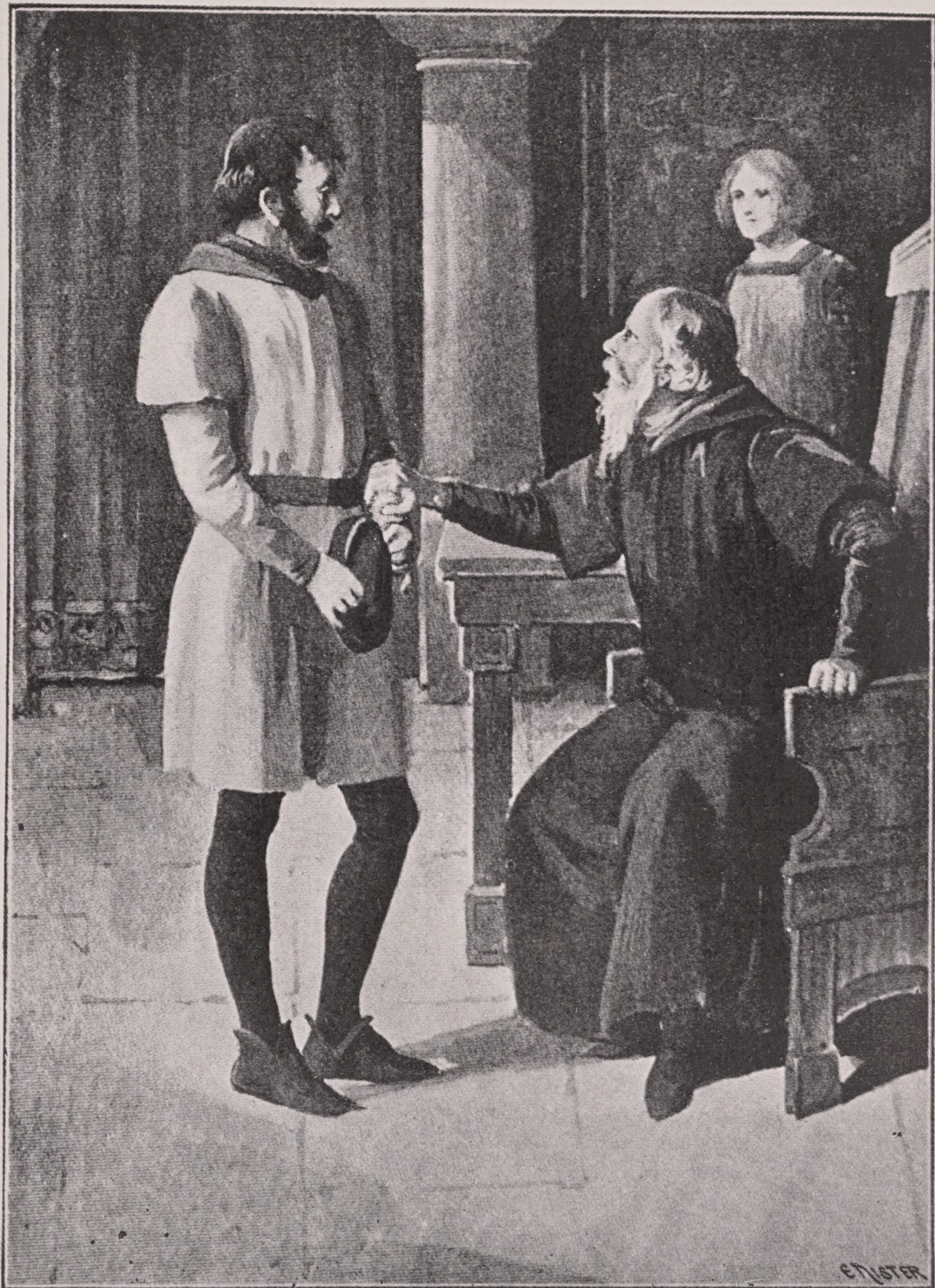
The Sheriff was watching the man very keenly, and suddenly caught him by the arm.