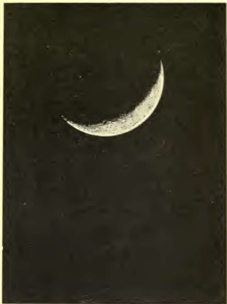
A DIGIT OF THE MOON