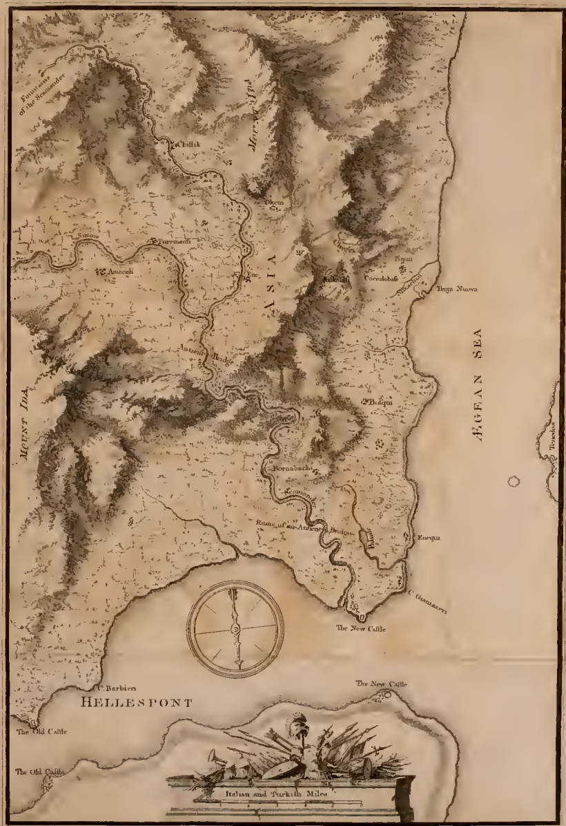
View of ANCIENT TROAS together with the SCAMANDER and MOUNT IDA as taken anno MDCCCL.