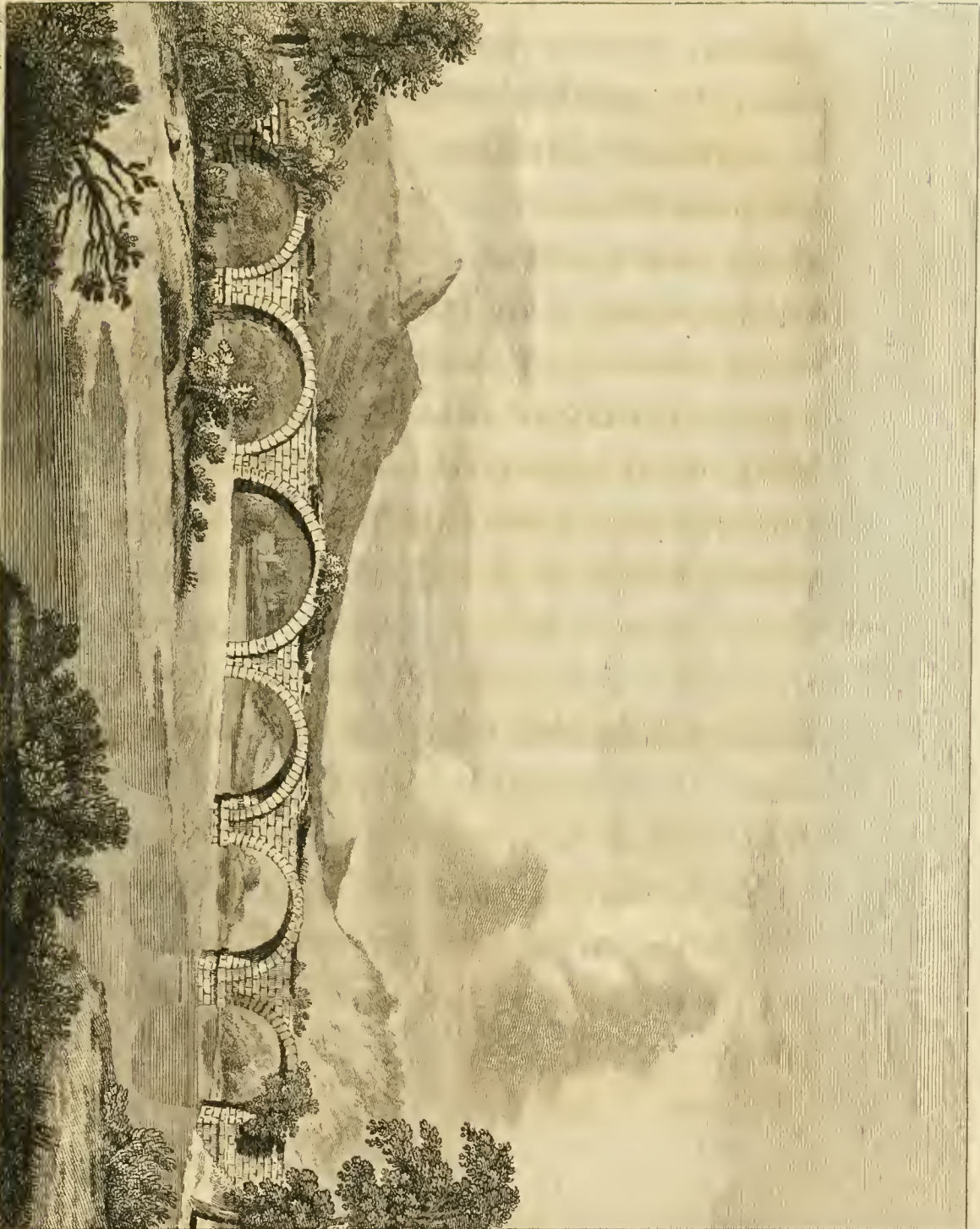
View of the RUINED BRIDGE below the JUNCTION of the two RIVERS.