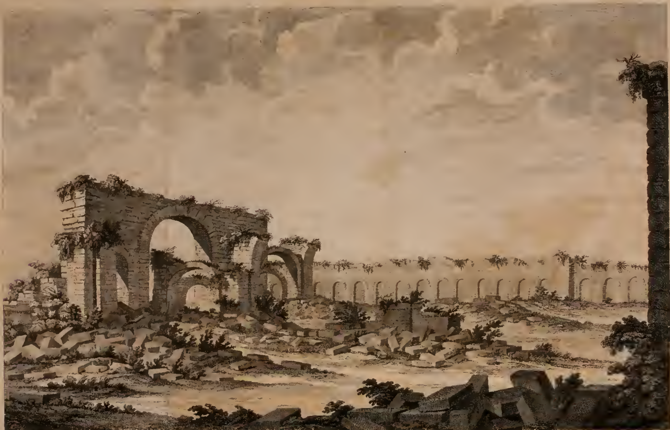
ANCIENT RUINS near TROY upon the ÆGEAN SEA. Supposed to be the work of ALEXANDER or LYSIMACHUS.