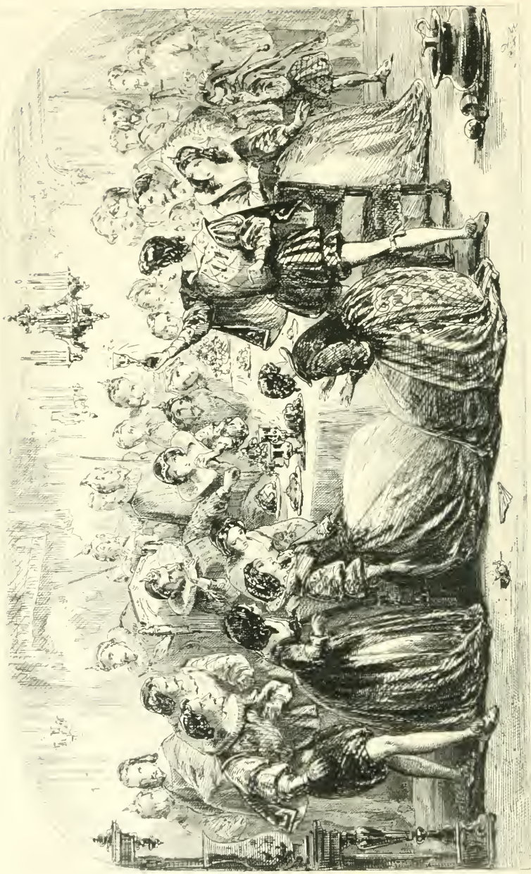
THE MERRYMAID (1857)