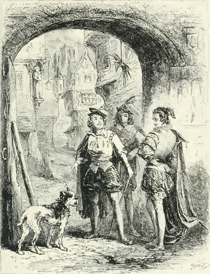
Illustration of a scene from a play, showing three men in historical attire standing in an arched doorway, with a dog in the foreground.