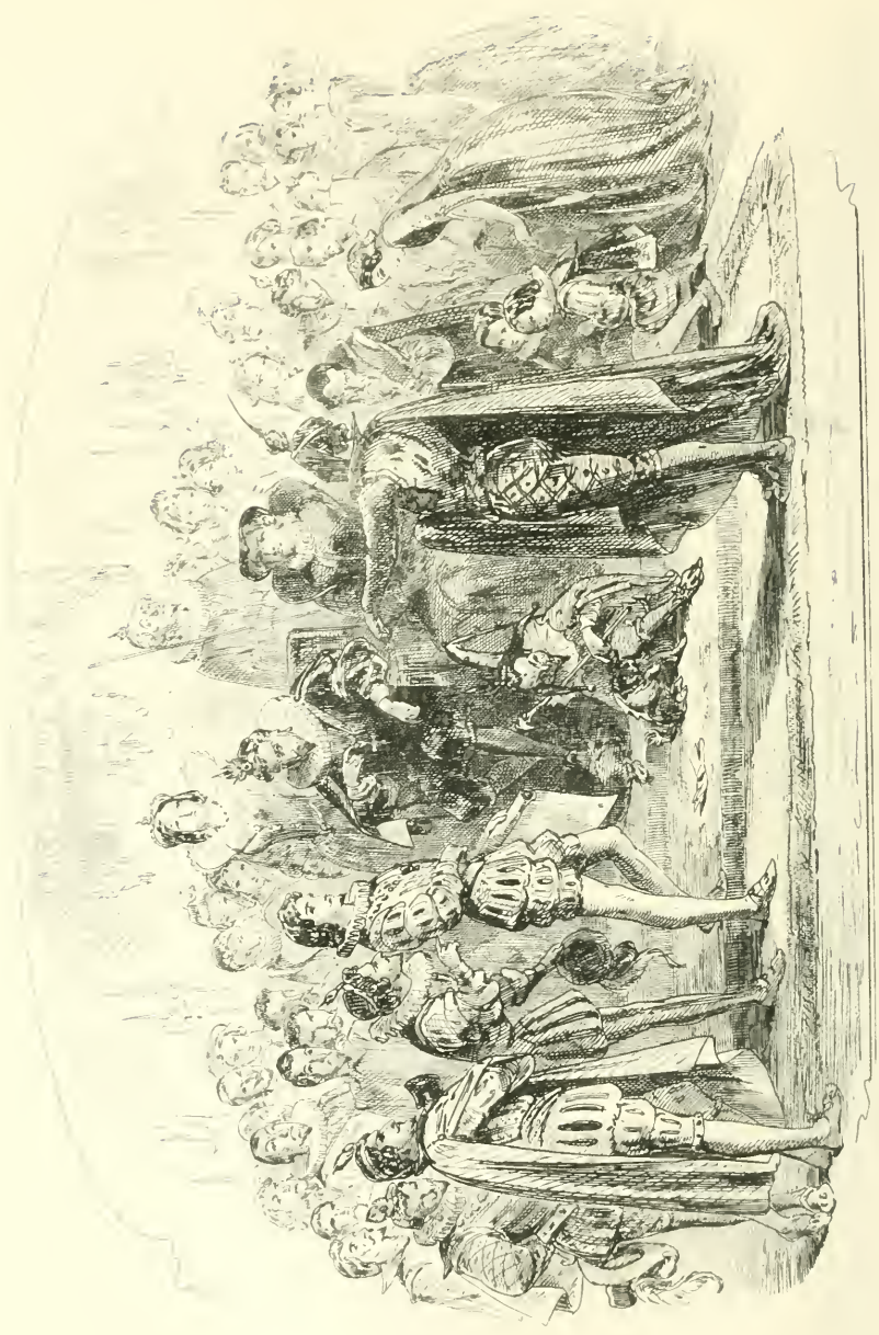
THE CORONATION OF KING EDWARD VII.