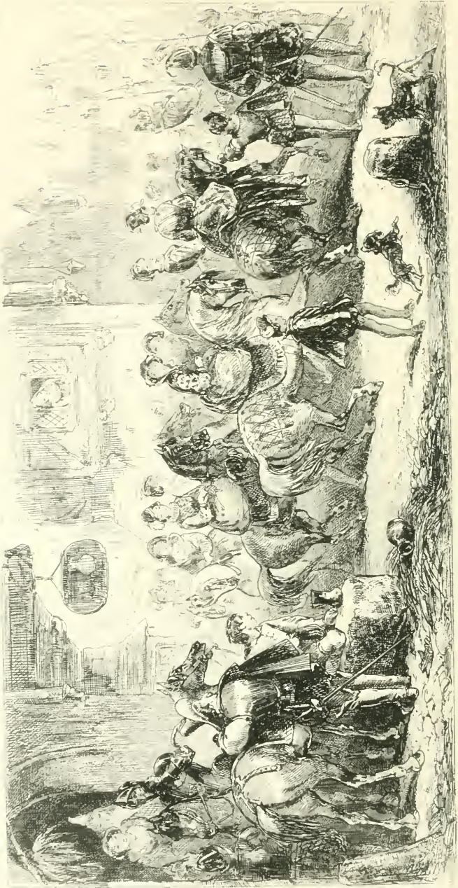
La Robotte recevant le mail