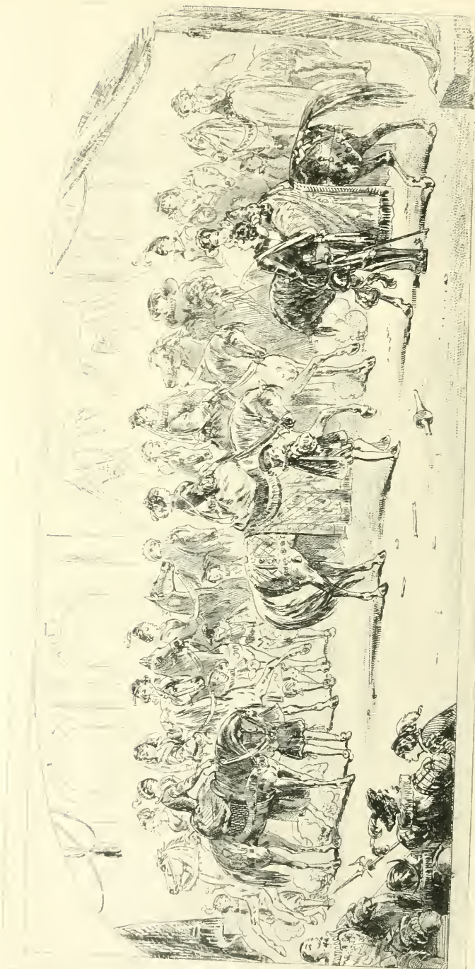
Caravan of pack animals and men