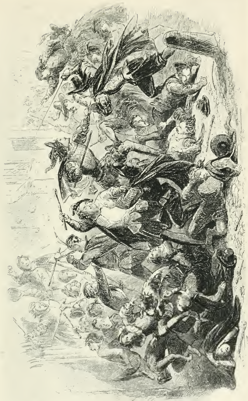
The Conflict with the students