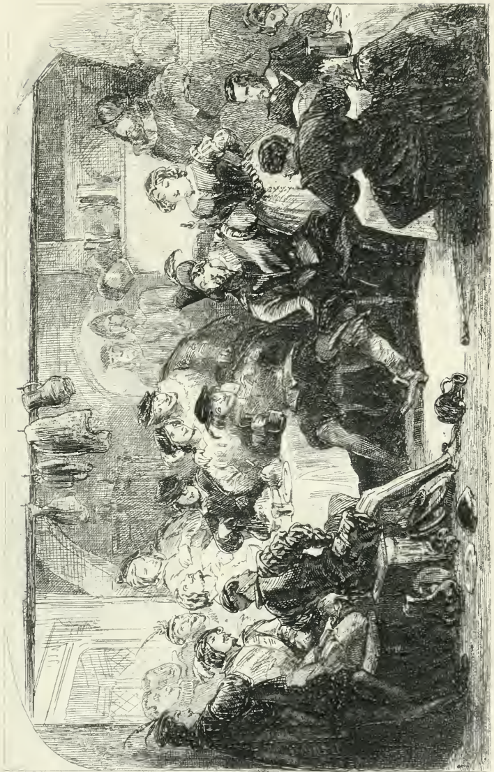
Hours of Rattle in the Evening