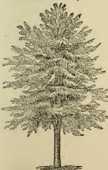
SILVER LEAF MAPLE,

European Larch. 3 ft., 25c.; 4 to 5 ft., 50c.