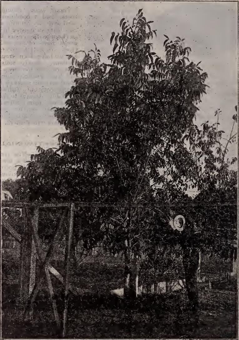
Budded Pecan Tree third year after planting. It bore 62 large nuts the third year, and 75 the fourth year in Thomasville, Ga.