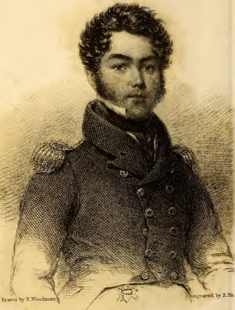
LIEUT G. BACK. R. N.