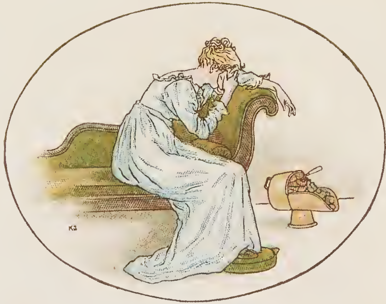
Yew . . . . . Sorrow