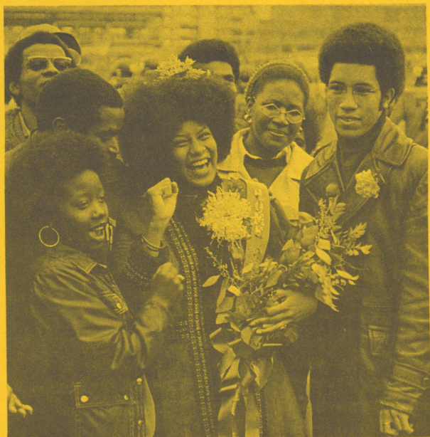
REIGNS OVER HOMECOMING