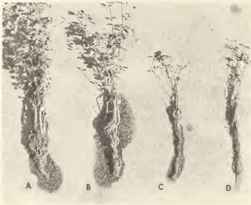
Figure 5.--Effect of rhizobial numbers on alfalfa planted in alfalfa sickness soil: A, 120,000; B, 12,000; C, 1,200; and D, 120 organisms added per gram of soil.

A second experiment was conducted to determine a lower dilution endpoint and to determine the effect of nutrient elements on inoculum levels required. From the Tiede and Ramsey locations 400 g. of soil were added to pint cartons. The pots were seeded with 10 surface-sterilized Ladak alfalfa seeds which, after germination and emergence, were thinned to 5 plants per pot. After seeding and prior to covering the seeds, known quantities of effective rhizobia strains were drenched over the seeds. The number of organisms added was determined by serial dilution and ranged from zero to 35,000 organisms per gram of soil. A fertilized series, as well as an unfertilized series, was included on both soils at all levels of inoculum. The nutrients were added to the fertilized series as 100 ml. of Ashby's nutrient solution (without nitrogen).