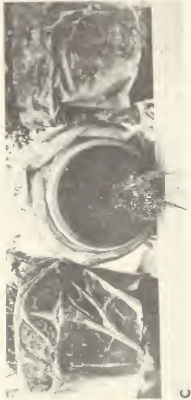
Figure 3.--A, Plants with effective rhizobia showing typical symptoms of alfalfa sickness transplanted from the sick field into the greenhouse; Plots 1 and 3 inoculated, pot 2 not inoculated. B, Condition of uninoculated plant (center) after an extremely windy and dusty spring. C, Effective nodules on roots of control plant following exposure to dust.