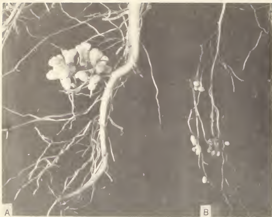
Figure 2.--Roots of alfalfa plants with A , effective nodulation and B , ineffective nodulation.