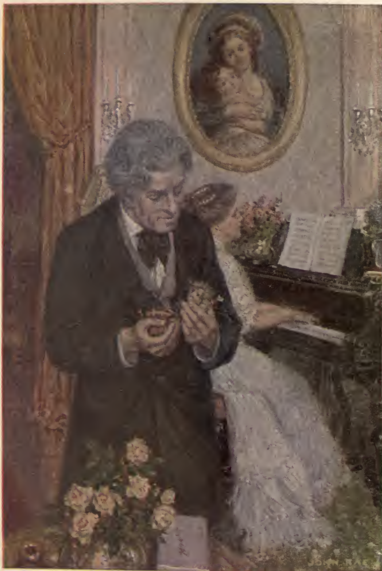
“HE SAW ONCE MORE HIS LITTLE GIRL PLEADING WITH HIM TO MEND THE DOLL WITH THE BROKEN EYE” (p. 275)