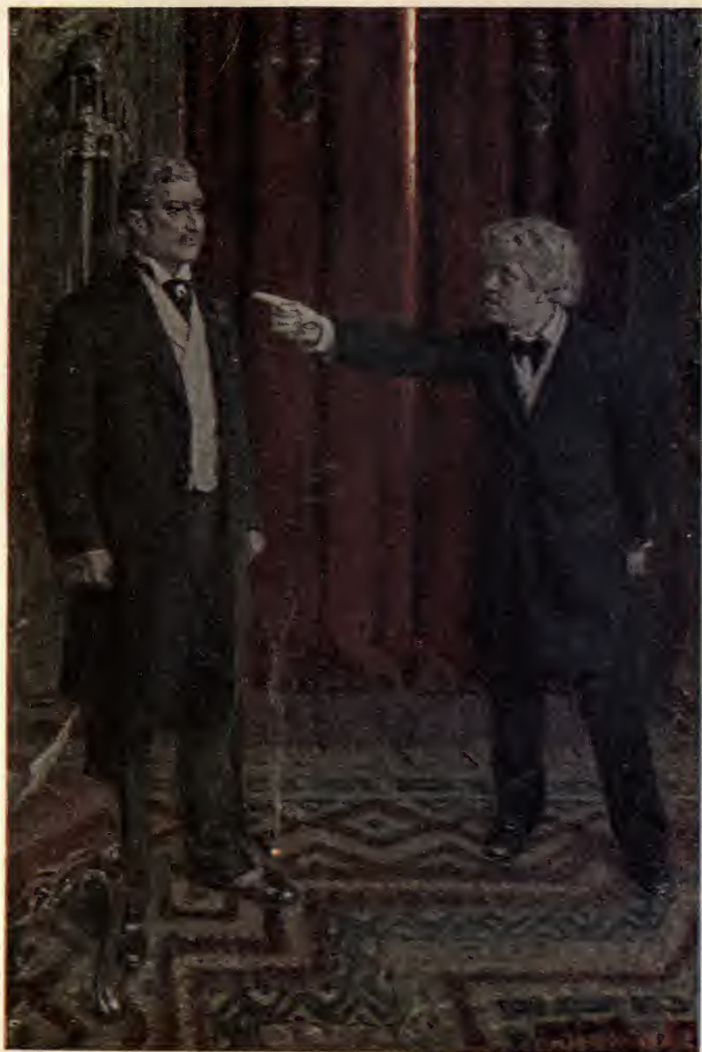
"SHE SHALL CHOOSE BETWEEN US"