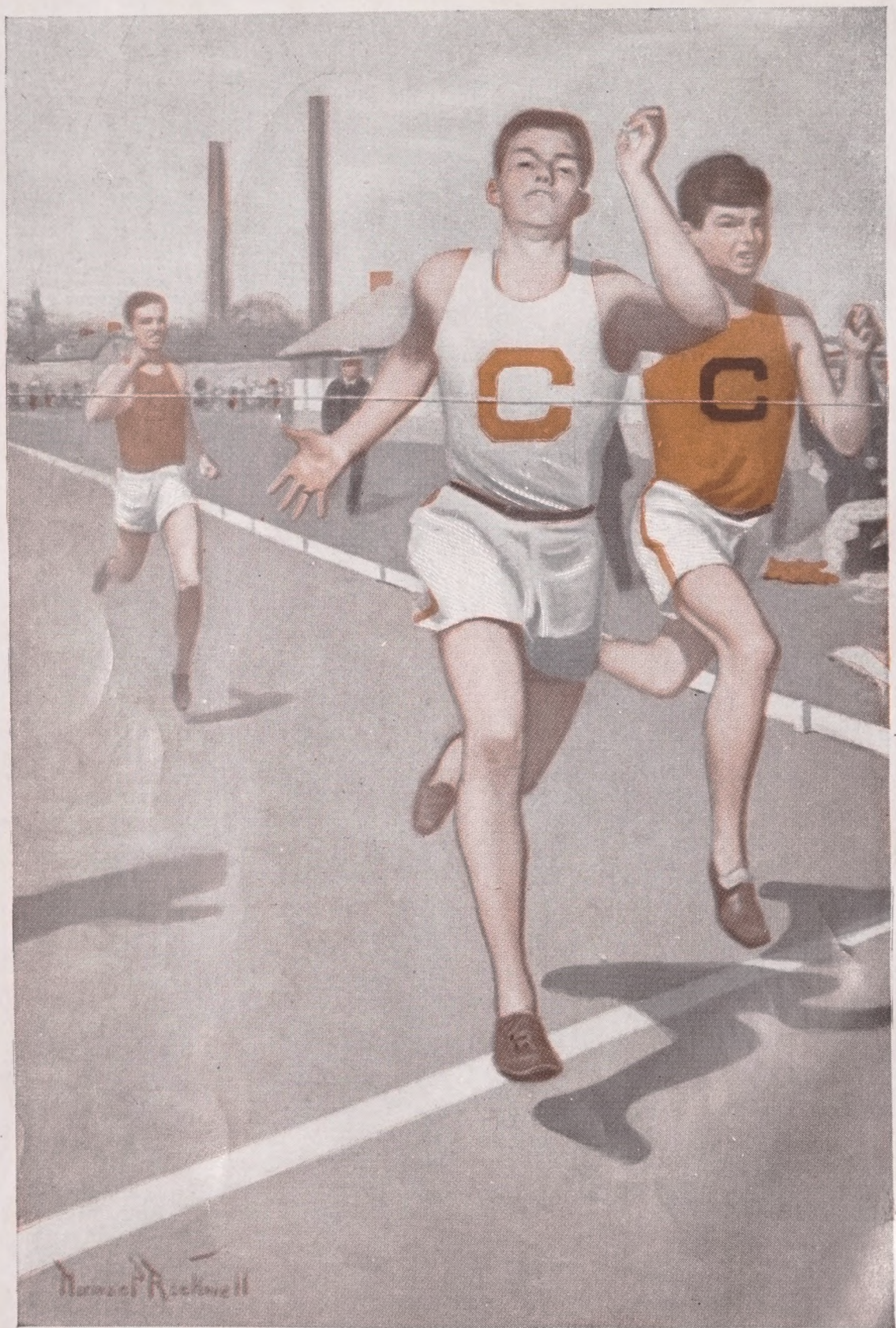
“Like a white streak, Perry breasted the string” [Page 318]