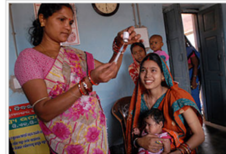
Community health worker preparing a vaccine in Odisha, India