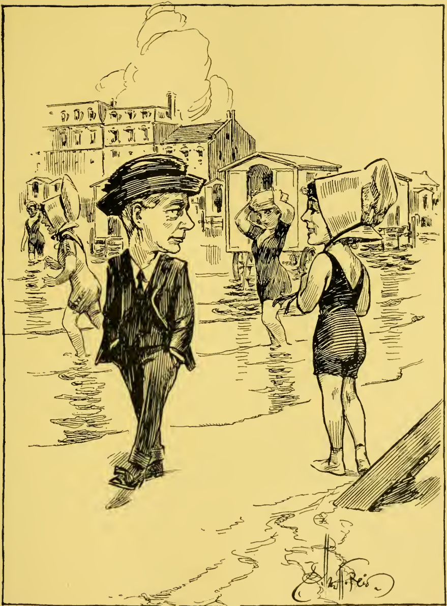
NO PLACE FOR A MAN FROM KANSAS