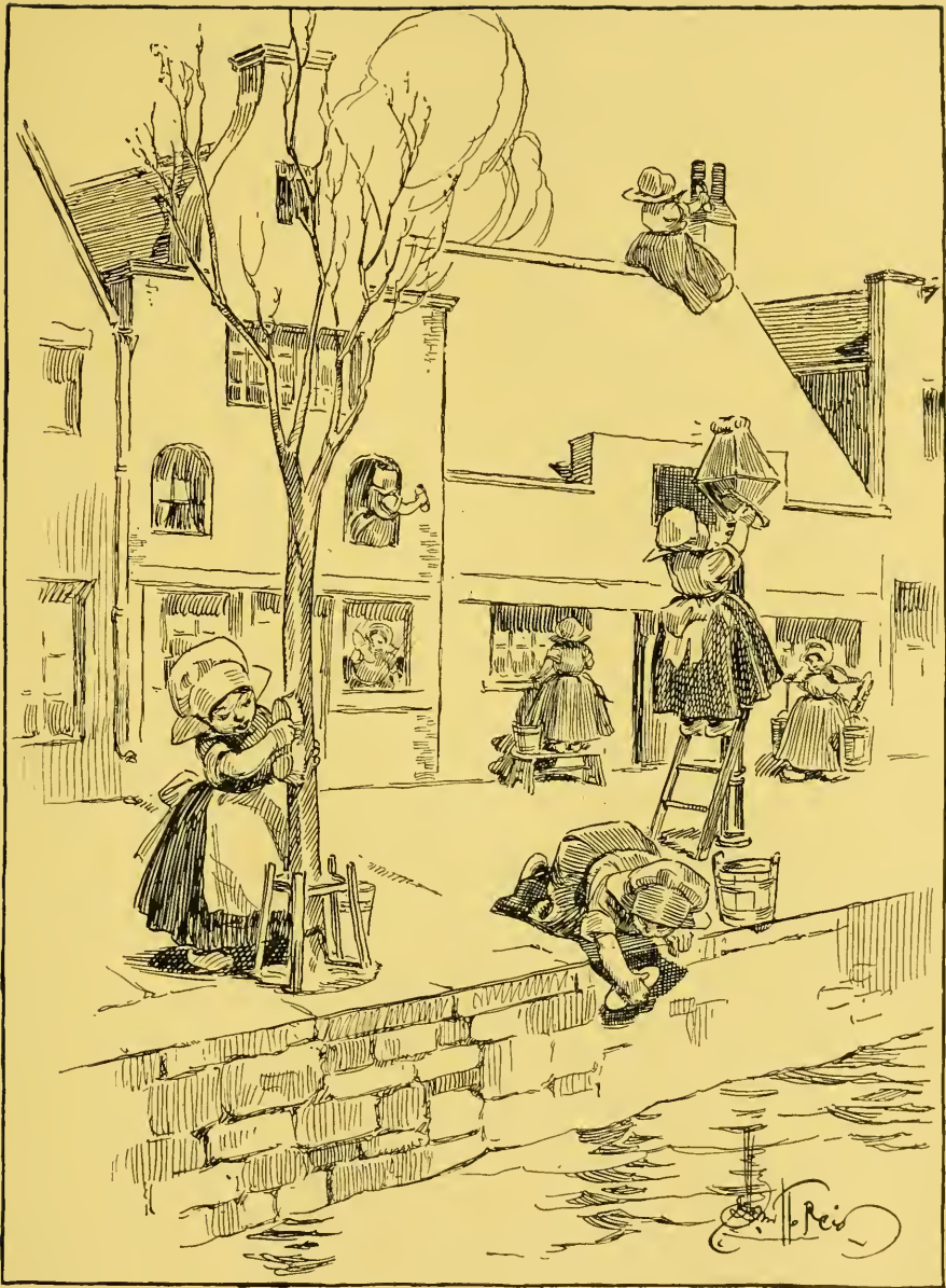
THE SCRUBBING-BRUSH THE NATIONAL EMBLEM OF HOLLAND