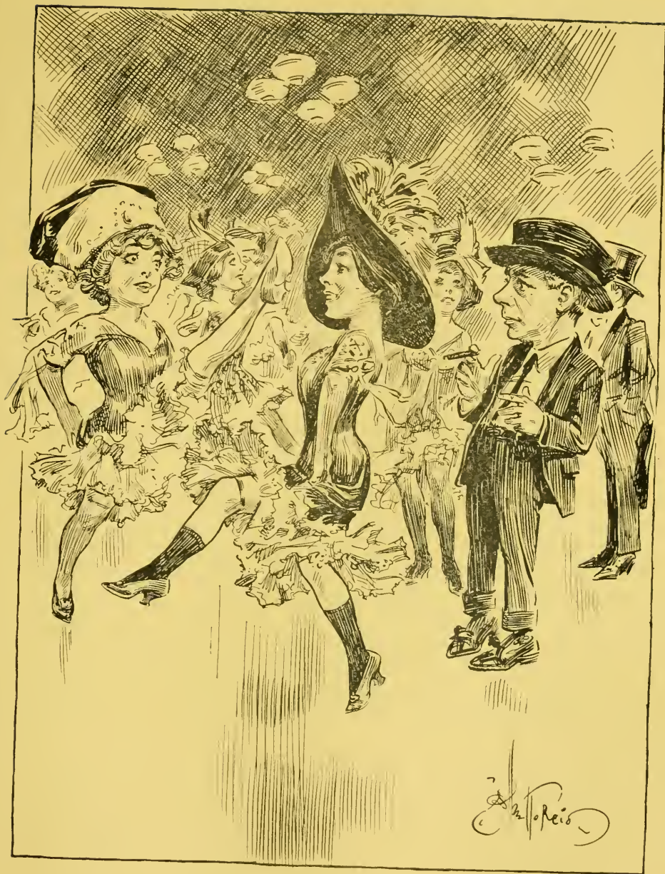
THE PLAIN QUADRILLE AT THE MOULIN ROUGE