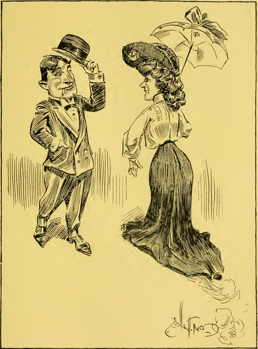
THE HANDSOME KNIGHT SHE MET IN ELMDALE PARK