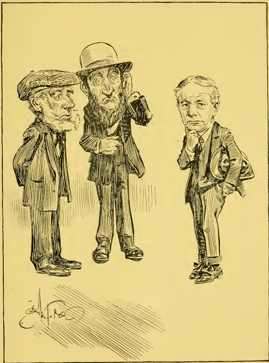
INTRODUCING A JOKE TO OUR BRITISH COUSINS