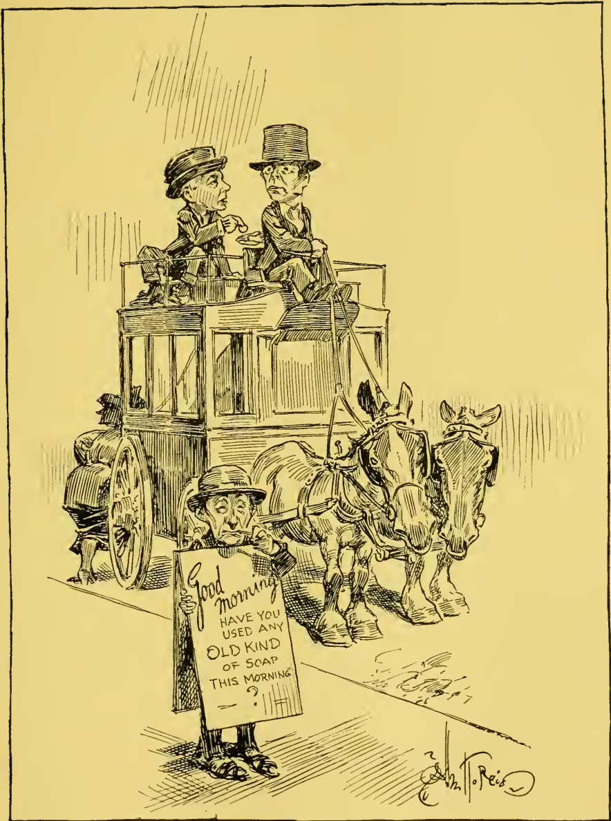
SEEING LONDON FROM THE OLD ENGLISH BUS