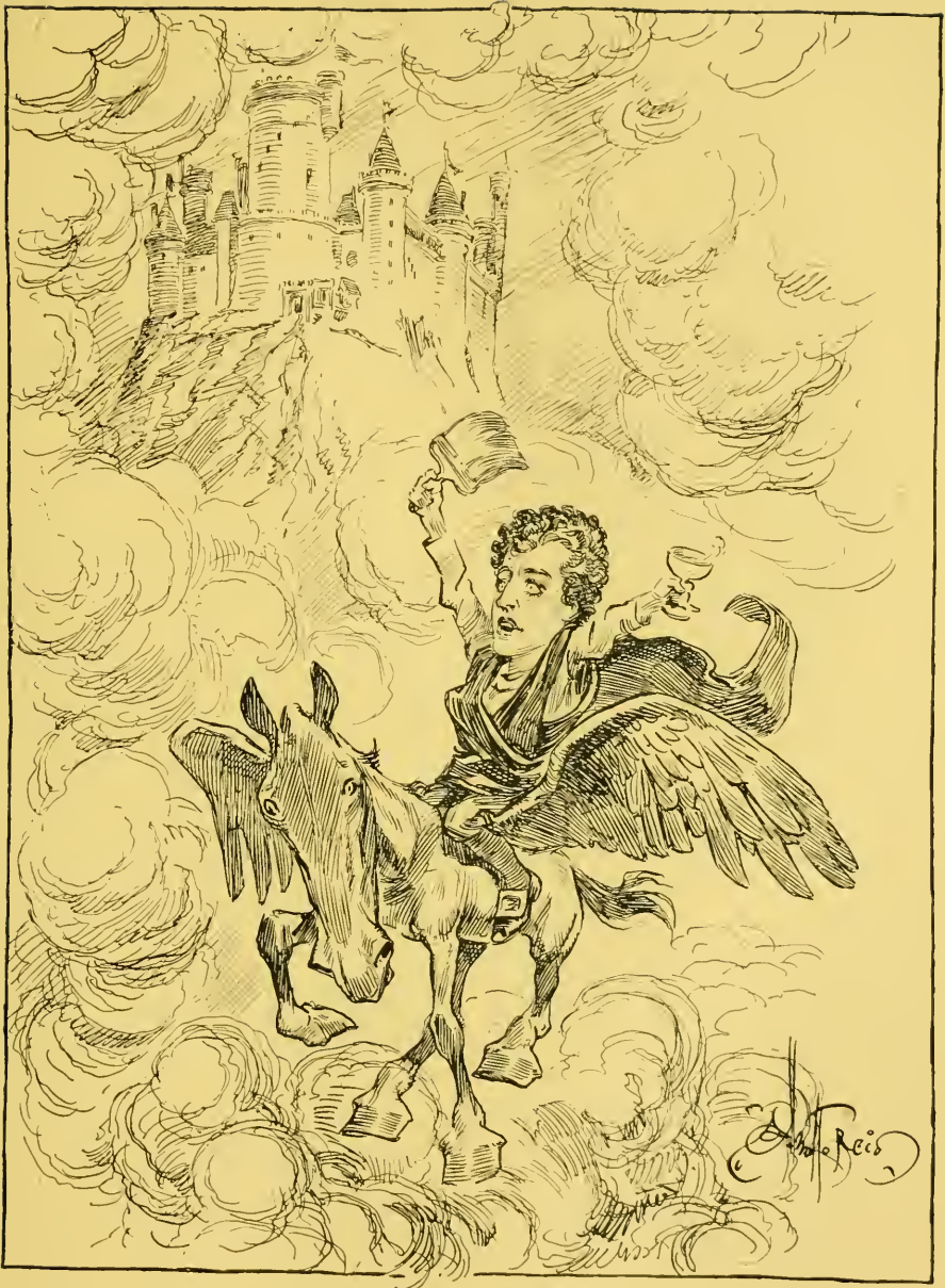
THE POET BYRON BUILDING CASTLES