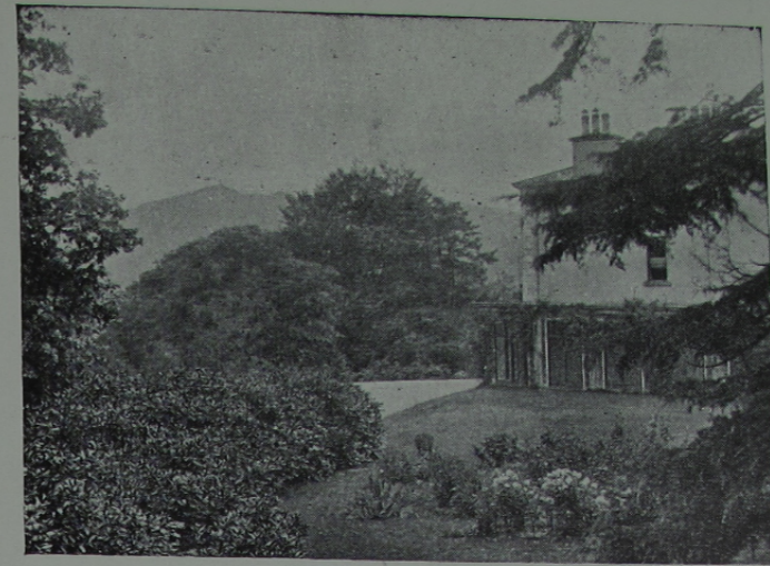
View of College from East

A three-years course is now taken by the students, the first part of which is of a general character, while some specialisation is undertaken during the latter part of the training.