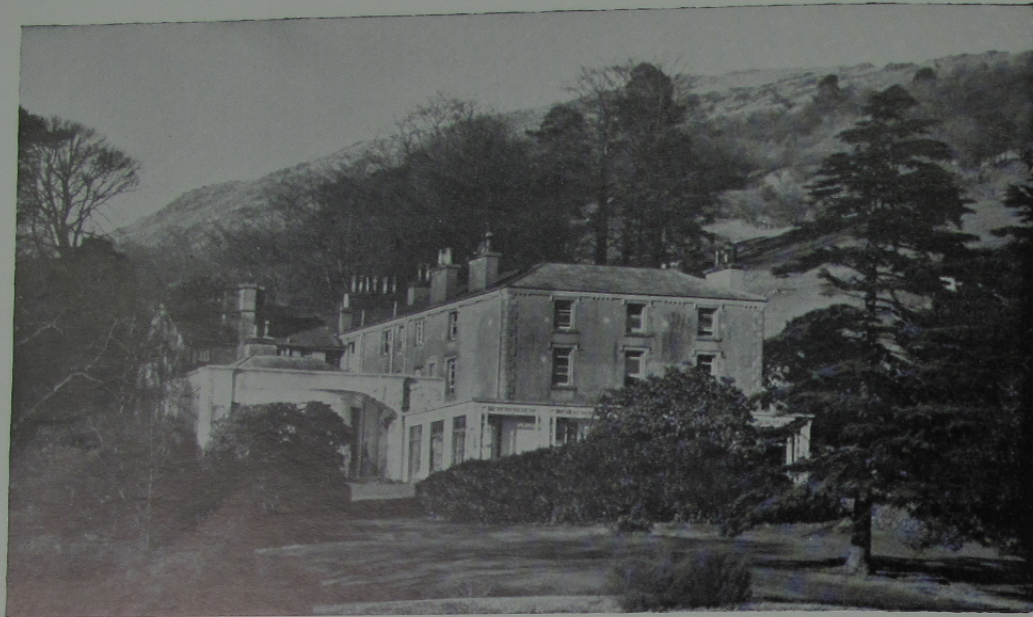
The Charlotte Mason College, Ambleside

The College was founded by Charlotte Mason in 1892 in Ambleside. She gave as her reason for choice of place her desire 'by means of field work under able leaders, to give such knowledge of geography, geology, botany, natural history of the Lake Country as teachers should be prepared to give their children concerning the neighbourhood of their own homes'. To this there should be added English Literature, owing to the rich literary associations of the district, and local history.