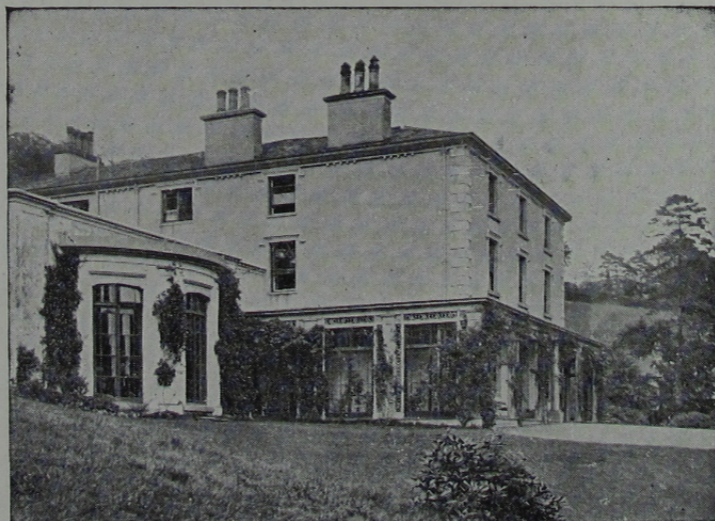
View of College from South-West

For further particulars please write to the Principal, Charlotte Mason College, Ambleside.