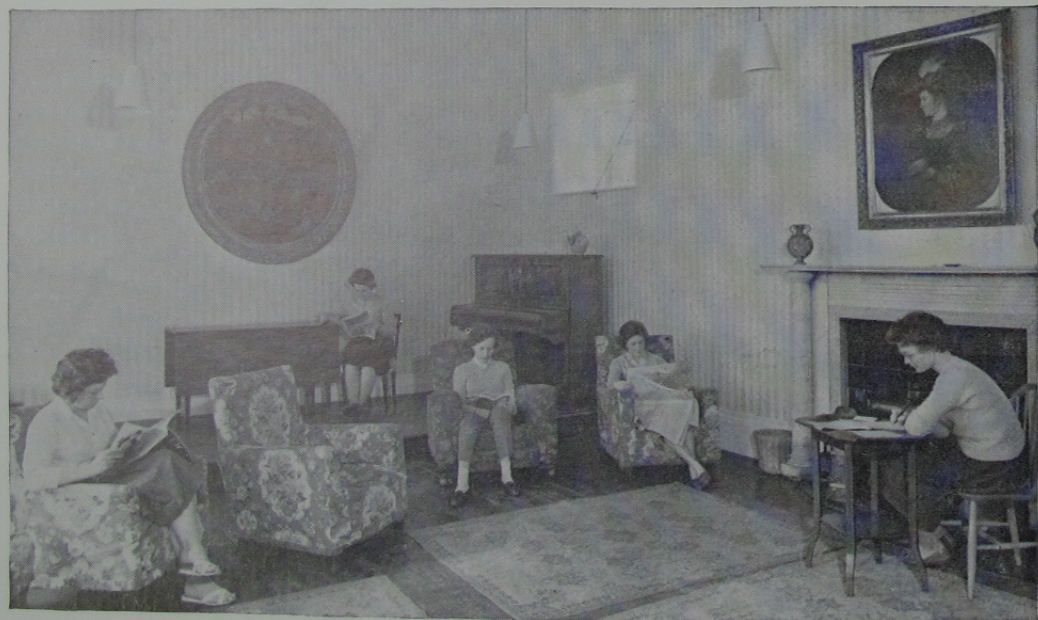
Main Common Room