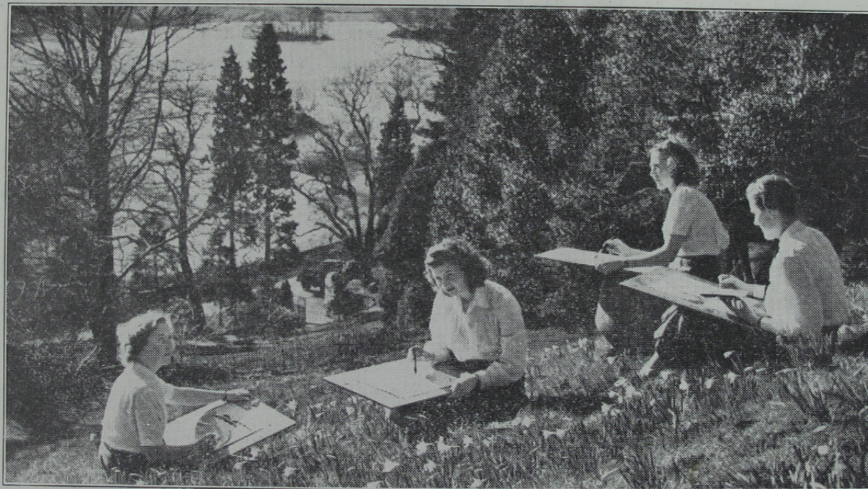
Students sketching in Dora's Field

Since the college is independent, though recognised, it receives no grant from the Ministry of Education. Consequently, prospective students cannot obtain grants from the Ministry for their training, but they are eligible for a 'further education grant' from their local education authority. It should be remembered that, being under no obligation to the Ministry, students of the Charlotte Mason College are free to make their choice of post on completion of the training.