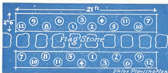
No. 3—A Double Border of Phlox Along the Garden Path. Plants Spaced 2 Feet Apart. 1 Collection for Each Side.