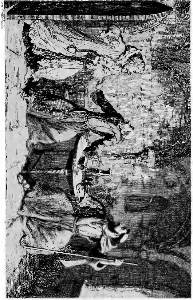
Abolitionists' escape from the dungeon.