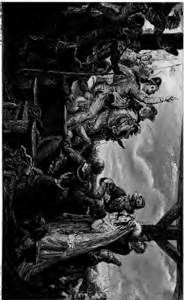
Prince John & Queen at the Marriage of St. Michael at Ashby.