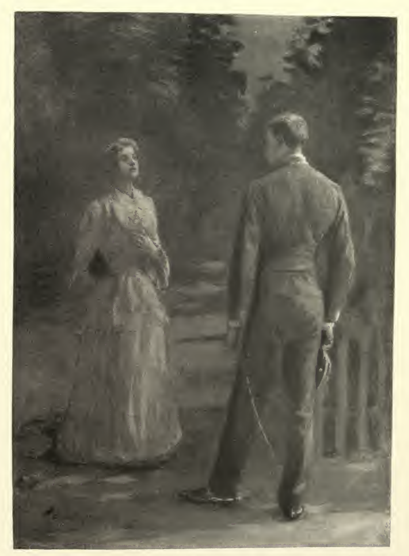
" De moon come' out, an' I cotch sight on her stan'in dyah in her white dress."