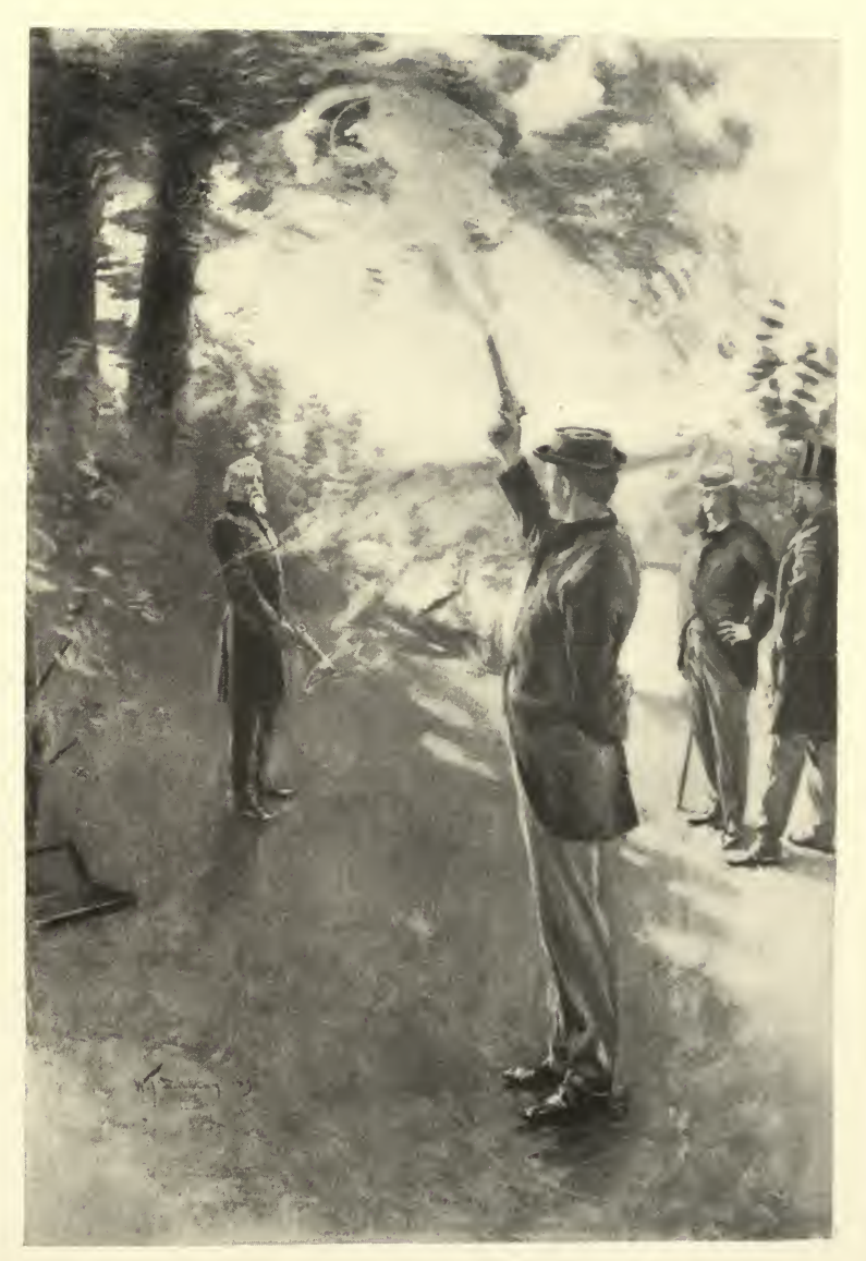
"'I mek you a present to yo' fam'ly, seh ! "