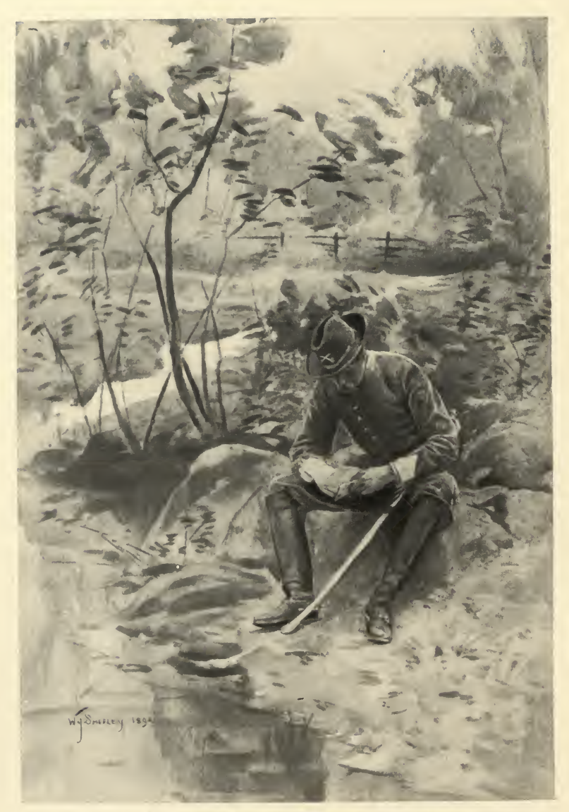
" I see Marse Chan read dat letter over an' over."