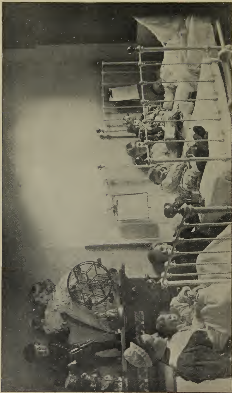
A GLIMPSE OF THE BOYS' WARD.