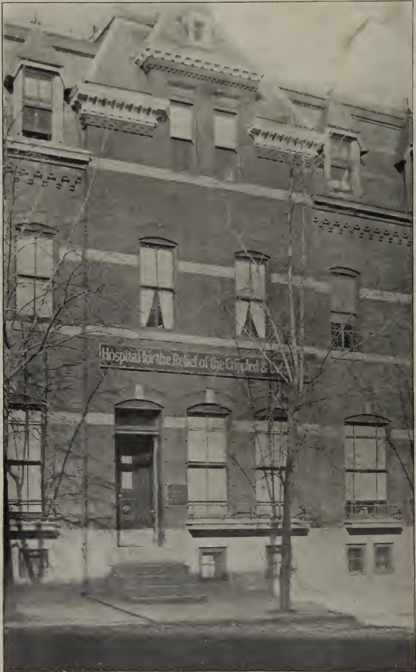
Dispensary Hours, 2 to 4 P. M. Daily, except Sunday.