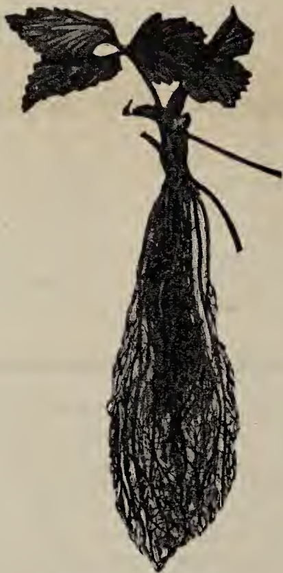
WALLER'S NEWGROUND PLANT

It costs less to fertilize and cultivate good berry plants because their strong system of disease-free roots are ready to grow when you get them. They do not have to be cajoled and pampered by special plowing and fertilizing. Set them on good land and give them proper care and cultivation—the plants will do the rest. Your yield will repay you ten-fold.