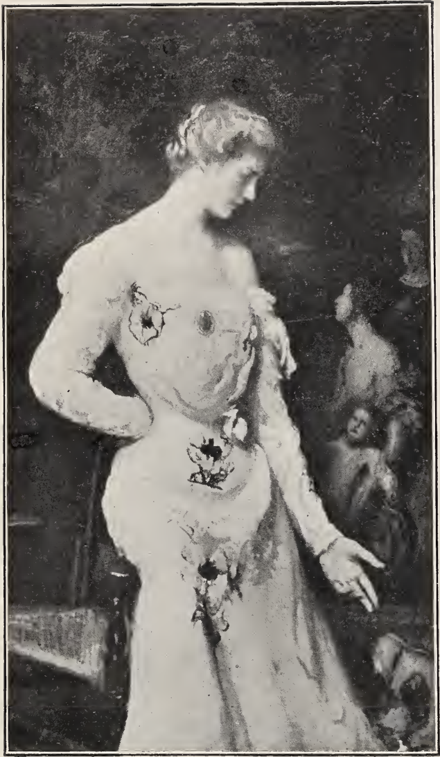
EDMUND C. TARBELL. Girl and Dog.