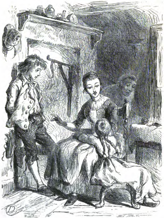
“Once upon a time, when Saint Nicholas was on the earth.”—p. 48.