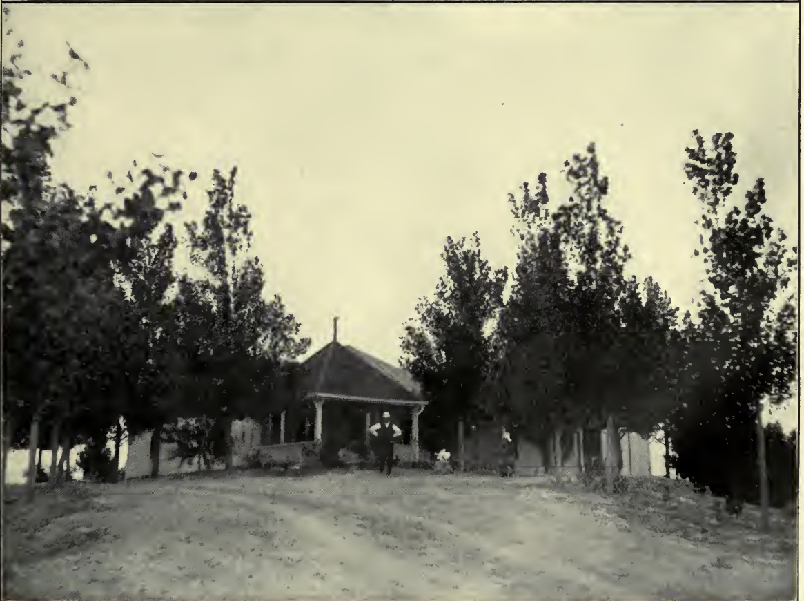
THE WELLINGTON RANCH.