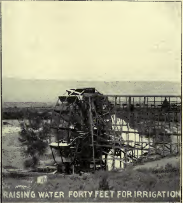
RAISING WATER FORTY FEET FOR IRRIGATION