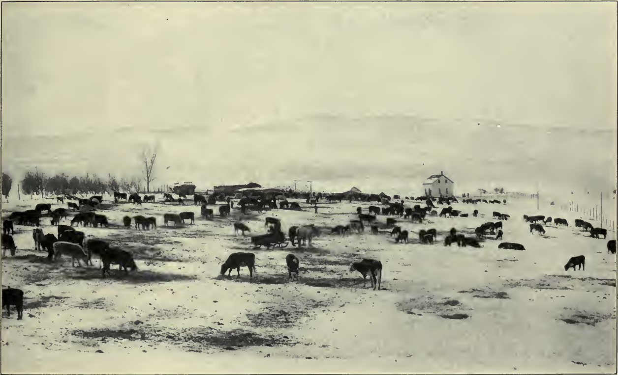
THE W. W. WURTS RANCH.