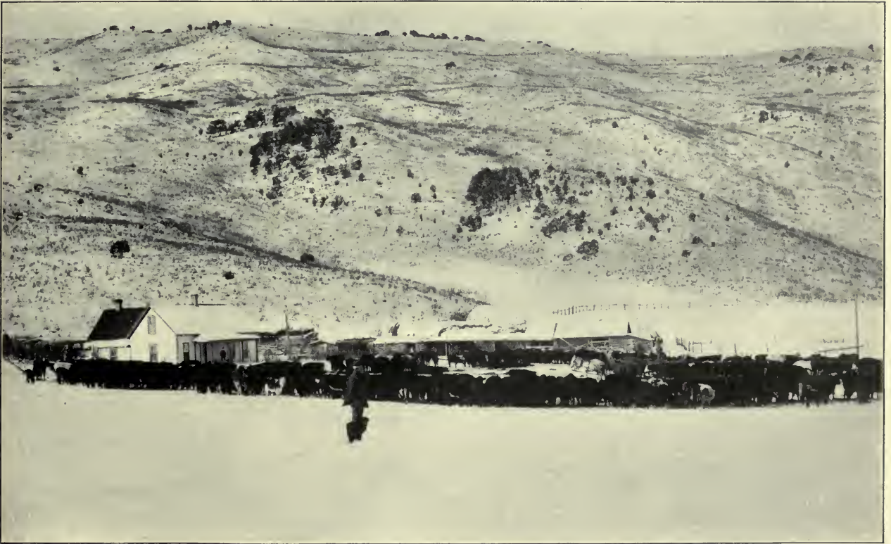
BONNIE BRAE RANCH, OWNED BY GEORGE YULE.