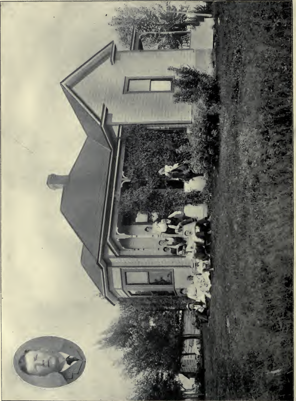
THE KENNEY RANCH, PLATEAU VALLEY, MESA COUNTY.