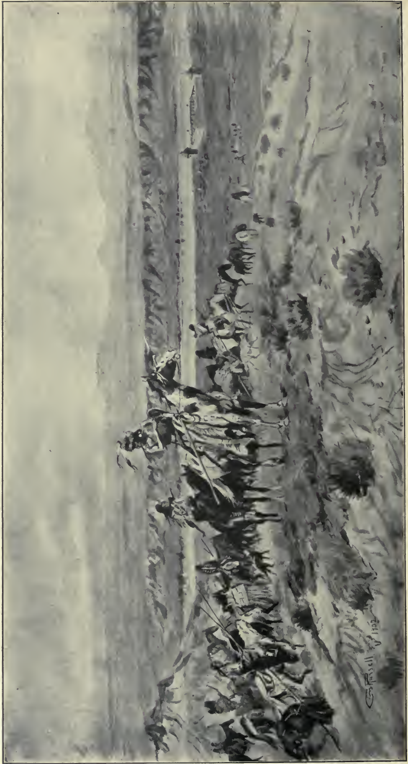
EARLY LIFE IN COLORADO.