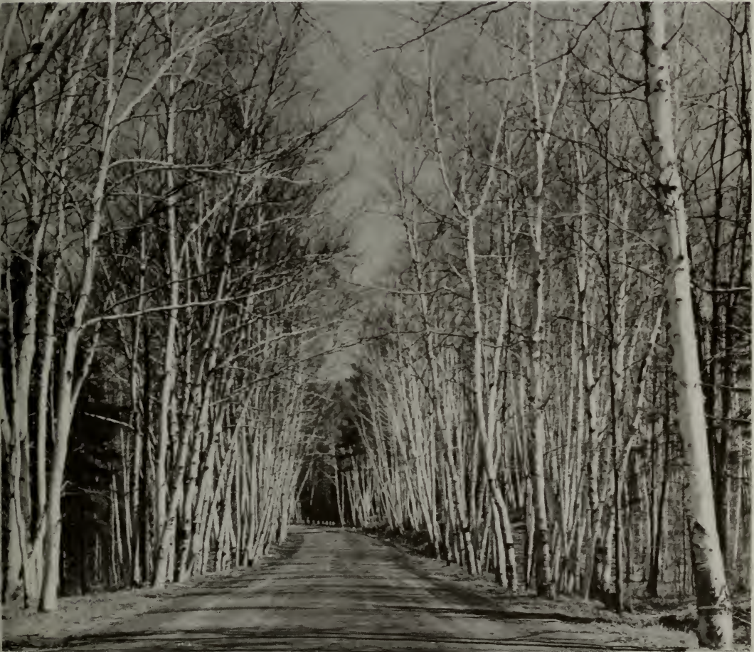
Figure 2. --In the United States, paper birch is most abundant in northern New England. This is one of the famous roadside stands of paper birch at Shelburne, New Hampshire.

Paper birch often grows in pure stands. More frequently though, it grows in mixture with other species. The