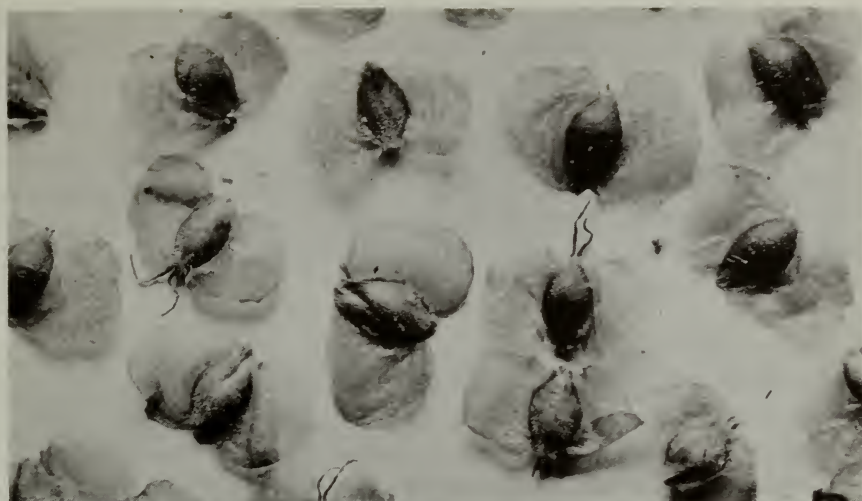
Figure 3.--Paper birch seed (6X). In good seed years mature stands produce huge quantities of seed.

vals. In good seed years mature stands may produce huge quantities of seed. In a current study in Massachusetts, an average fall of 18 million paper birch seeds per acre was recorded in 1955 on 1-chain-wide strips that had been clear-cut through a 70-year-old stand. 2