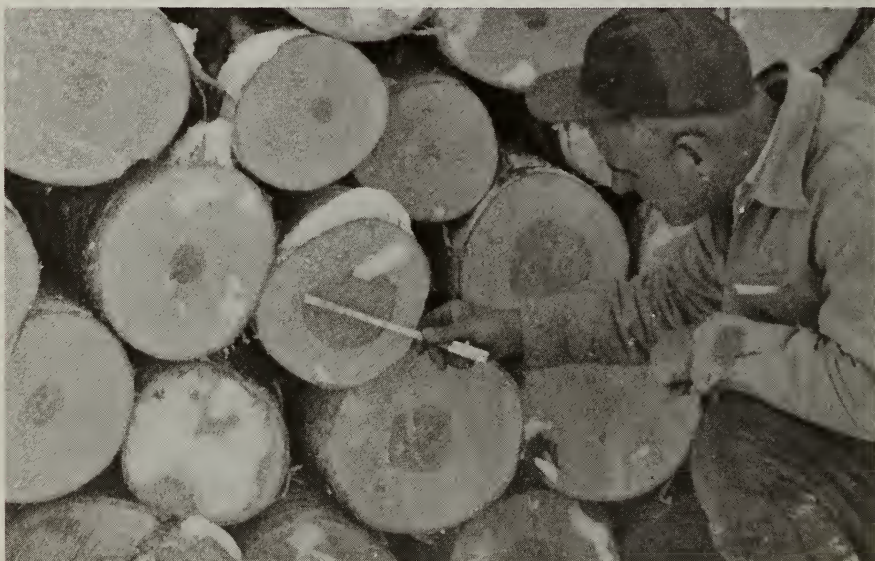
Figure 8.--Red heart is a serious defect in paper birch. A discoloration that resembles heartwood, it is believed to be caused by parasitic organisms.

Usually associated with both dieback and decadence is an insect, the bronze birch borer ( Agrilis anxius ) (5), which often kills weakened trees. During the outbreak in Maine in the 1940's it was considered very aggressive (51). Yet most experts do not consider it the cause of dieback, although it may be a determining factor in the death or recovery of trees (9).