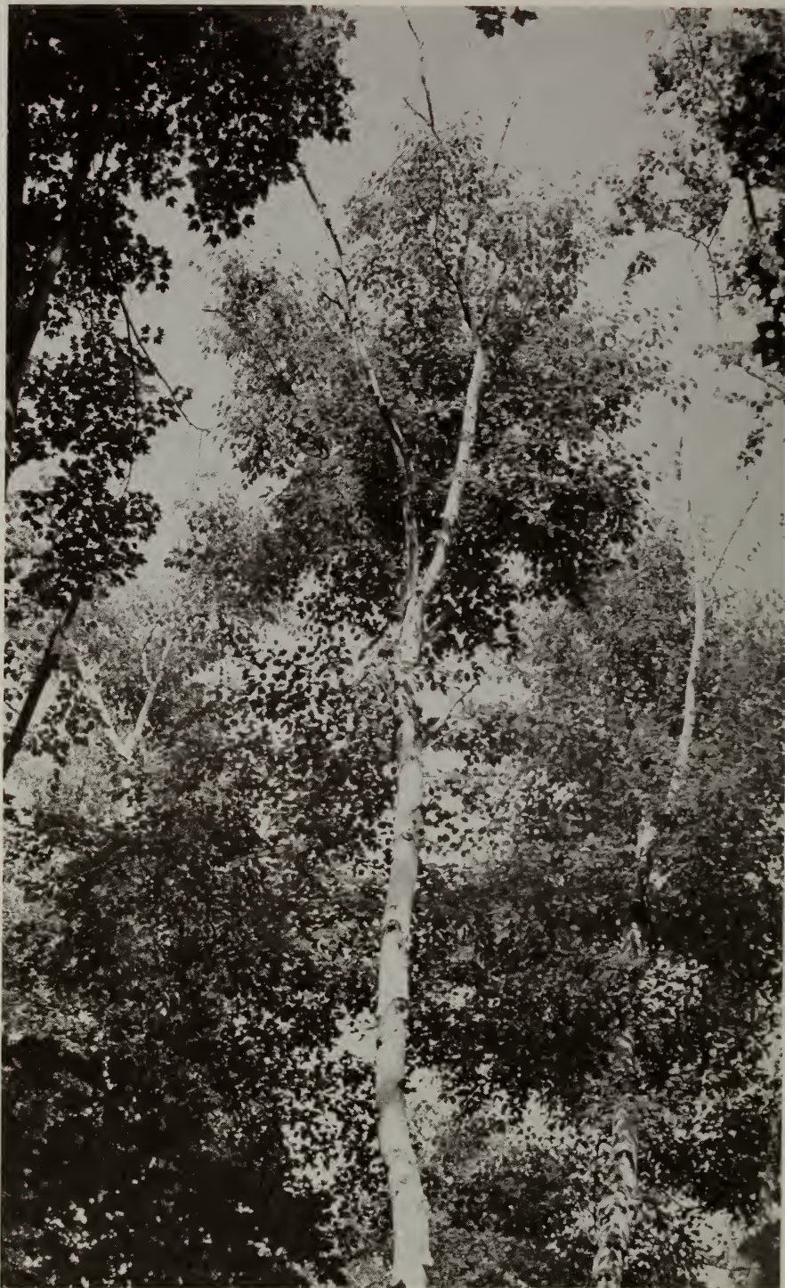
Figure 7. --The dying tops are a sign of decadence in paper birch. This condition often develops where cuttings expose the paper birch.