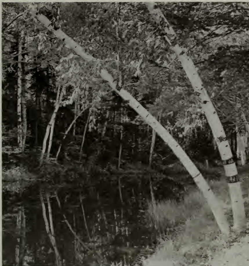
Figure 4. --The whiteness of paper birches brings beauty to many a woodland scene. Once the papery white outer bark is peeled off, it never grows back. Instead, a black scar is left.

the continued mortality, combined with crown decadence and reduced growth, result in a decrease in stand density. In pure stands, reproduction of more tolerant species such as spruce and fir then becomes firmly established. In mixed stands, the associated species become increasingly more prominent at the expense of the paper birch.