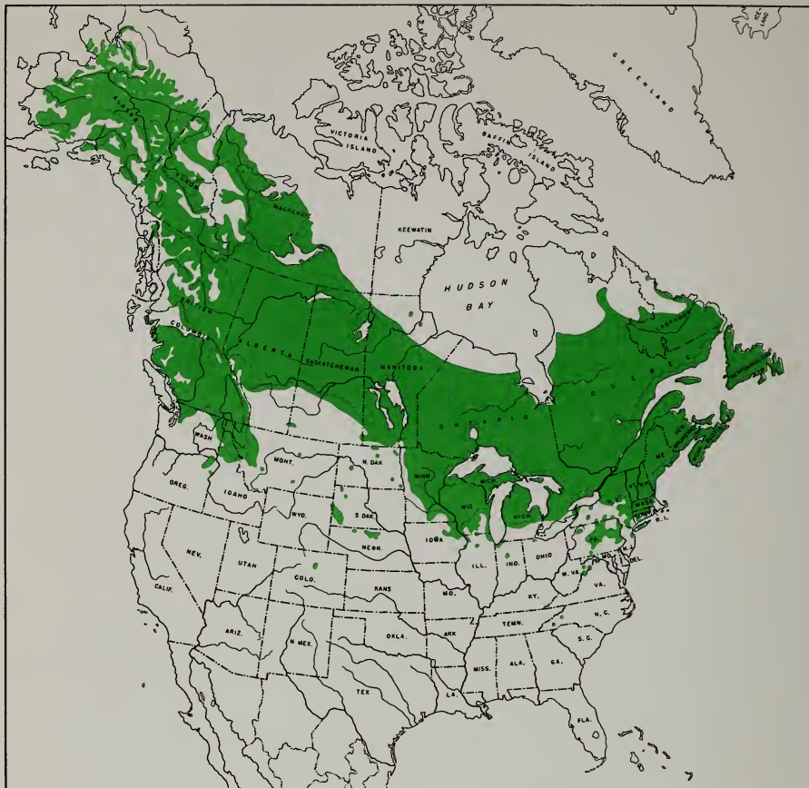
Figure 1.--The natural range of paper birch, including varieties. A tree of the cold climes, paper birch ranges northward almost to the absolute limit of tree growth.

The turnery and specialty industries sustain a continuing firm demand for this species, and supplies are decreasing. Both industry and forestry agencies are seeking ways to perpetuate plentiful supplies of paper birch through forest management. Sound forest management must necessarily be based on silvical characteristics.