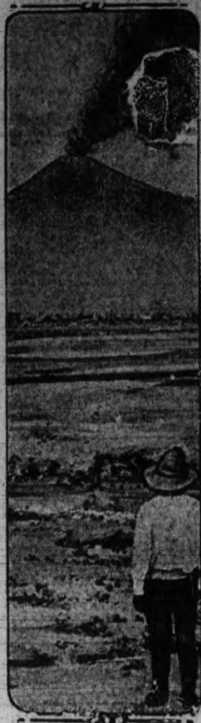
ACTIVE —The volcano Popocatepetl, twenty-six miles west of Puebla, Mex., is active again. Its eruptions are throwing hot ashes sixty miles away, according to advices reaching Mexico City. It is seen here puffing like a locomotive.