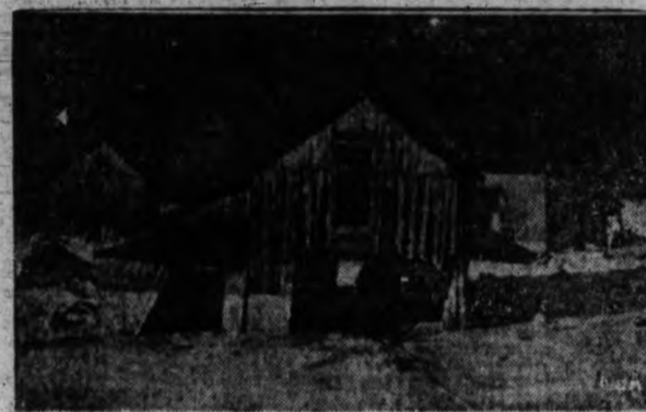
TWENTY-TWO DIE IN MUCK STREAM —Twenty-two persons were suffocated to death when a great mass of alkali muck swept through the village of Saltville, Va., when the muck dam of the Matheson alkali works gave way under pressure of flood waters. The muck covered the village like a stream of lava as may be seen in the photograph. A score of houses were demolished and many who were able to escape death were seriously burned by the alkali.