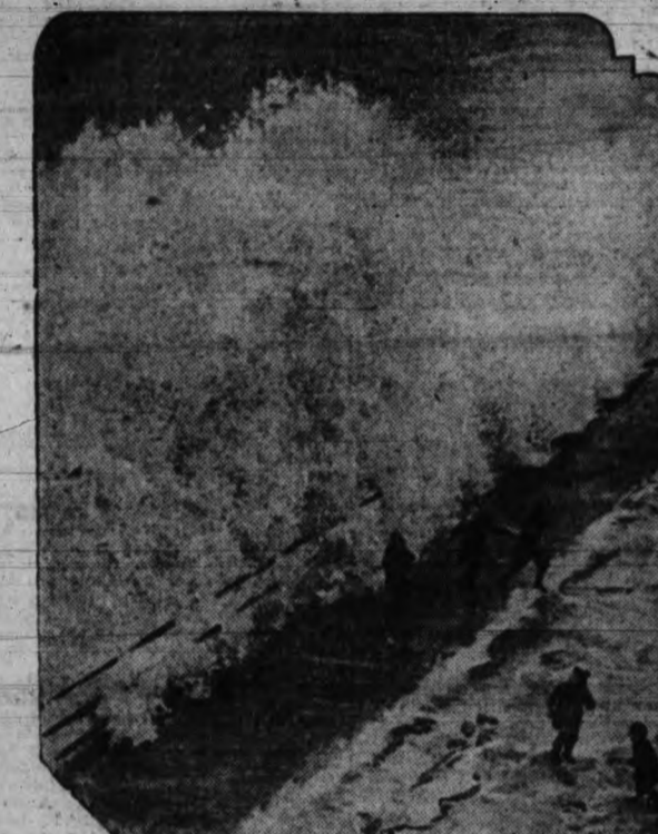
WHEN NEPTUNE DOES HIS STUFF —When Father Neptune does get his back up, it's some back. Here is shown a giant wave breaking against the boardwalk at Winthrop, Mass. The kiddies are having great sport in trying to dodge the downfalling shower of spray before it overwhelms them.