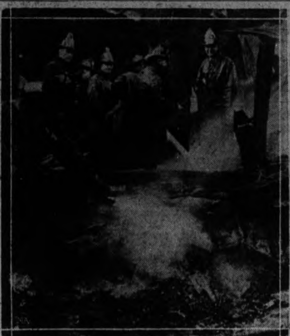
CONEY ISLAND FIRE —The celebrated New York playground, Coney Island, was swept by a fire that caused hundreds of thousands of dollars damage. Several bathhouses and part of the boardwalk were destroyed. Photo shows the firemen putting out the last embers after a hard fight against freezing weather and high winds.