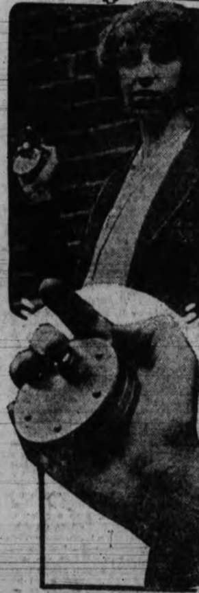
BANDIT CHASER —This little thing-a-ma-jig looks like a tape line all rolled up. It isn't. It's a stretchal, a new device to rout bandits. You can hold it in either hand, or throw it away from you when you press the button. It automatically explodes twenty-two blank cartridges in succession. The explosions, according to the inventor, can be heard half a mile. Elsie Sulkop of Cincinnati is seen here trying it out.