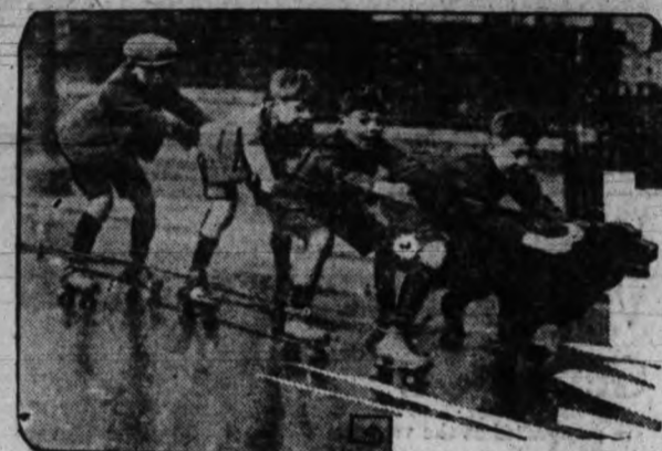
OH, TO BE A BOY AGAIN —What wouldn't you give to be a boy again and do stunts like this. The kiddies in London have a new sport all their own, designed for their roller skates. With their pet dog for a horse they go sailing down the walks at 2 m.p.h.