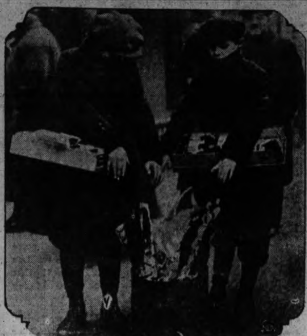
IN NEW YORK —Boys fill the ranks of the itinerant peddlers who cry their wares in great numbers on the streets of New York's East Side. But these cold days are hard on bare hands, so an old can on the sidewalk and a little wood helps to keep them warm. And the cops walk by with uplifted eyes.