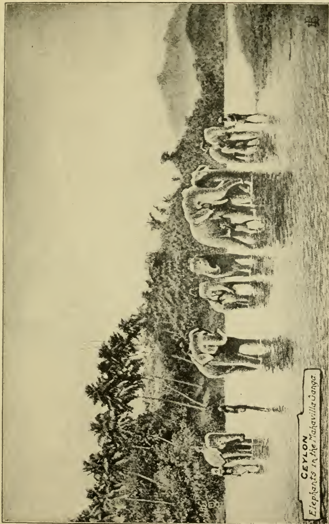
CEYLON Elephants in the Mahavilla Uanga.