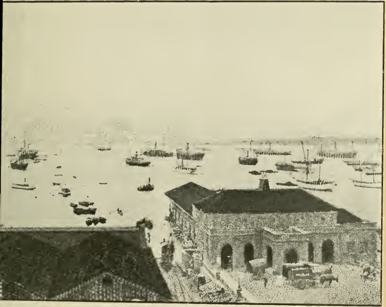
Colombo Harbour and Landing Jetty, Colombo