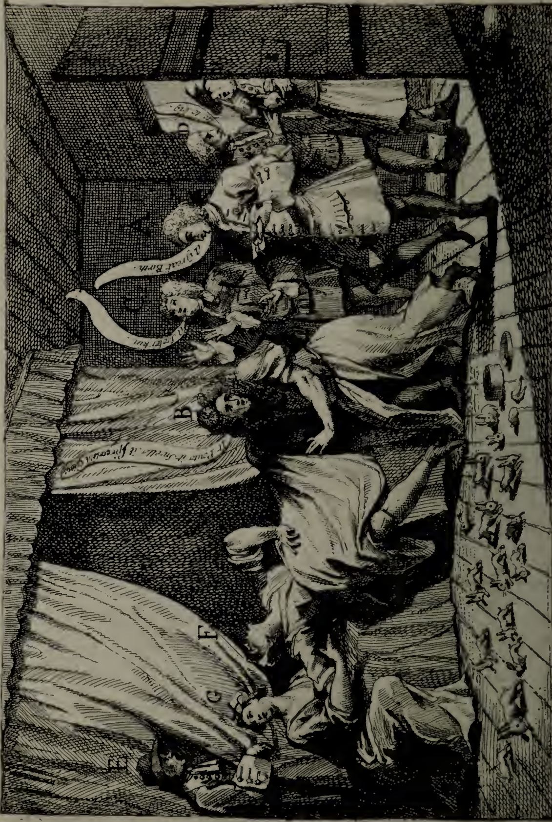
D The Quizzed Rabbit-Man, Madrigal E The Rabbit-getter F The Lady in the Draw G The Nurse or Rabbit-Dresser