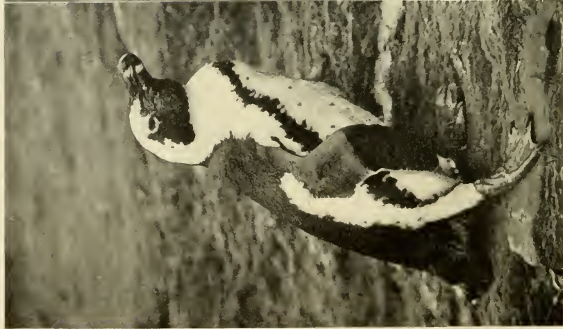
BLACK-FOOTED PENGUINS IN THE ZOOLOGICAL PARK.