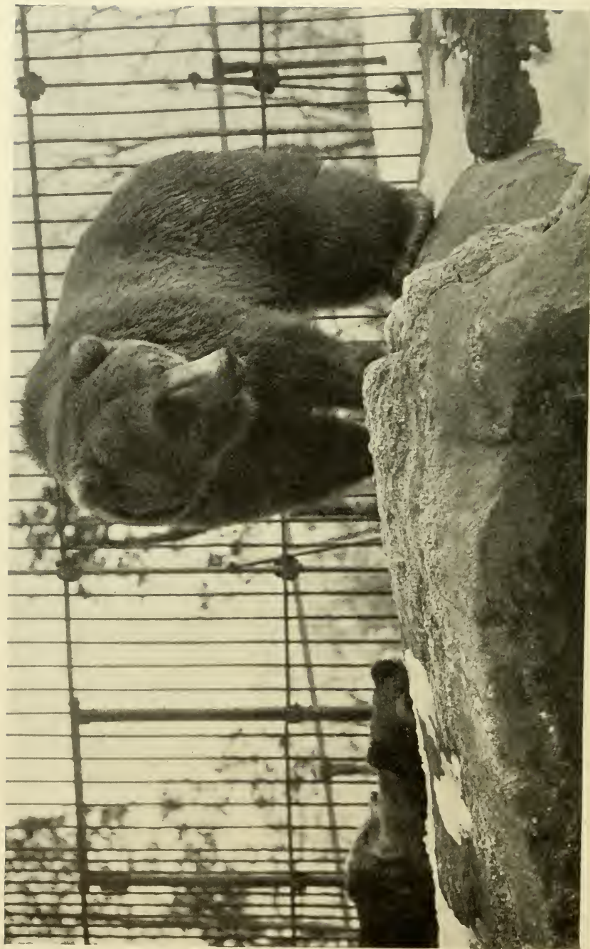
PENINSULA BEAR CAPTURED AT MOELLER BAY, ALASKA PENINSULA.