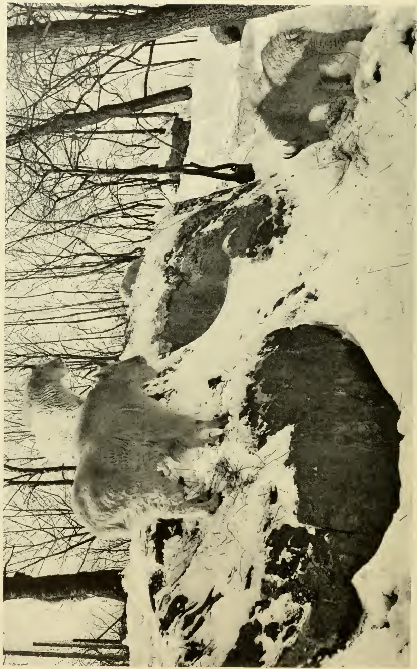
ROCKY MOUNTAIN GOATS IN THEIR RANGE.

This herd has been living in the Park since October, 1905.