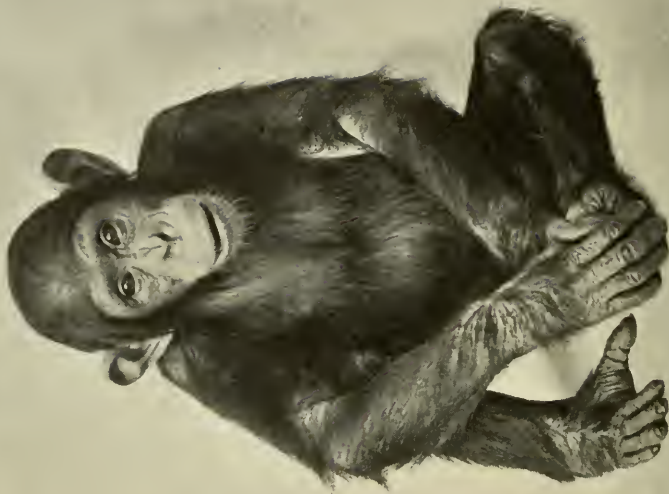
LONG-HAIRED CHIMPANZEE "BALDY." Pan pygmaeus (Schreiber) Equatorial West Africa.