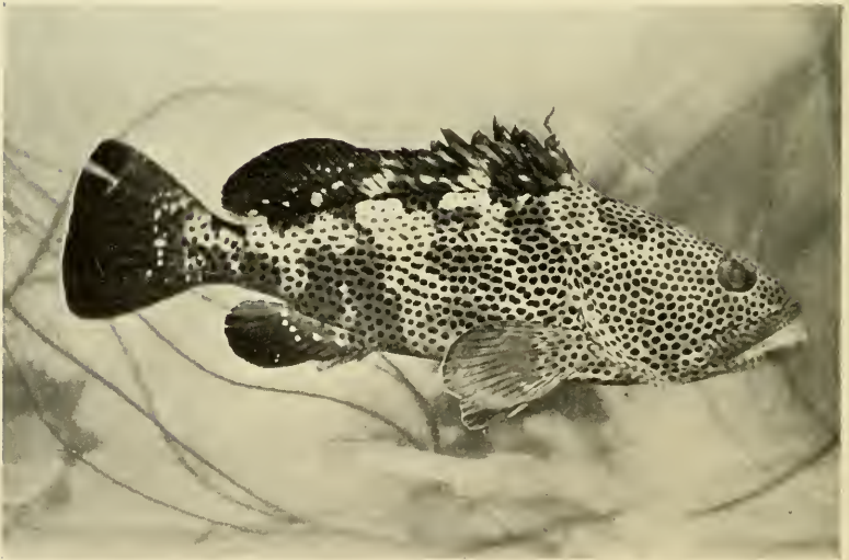
SPOTTED HIND. Epinephelus guttatus.