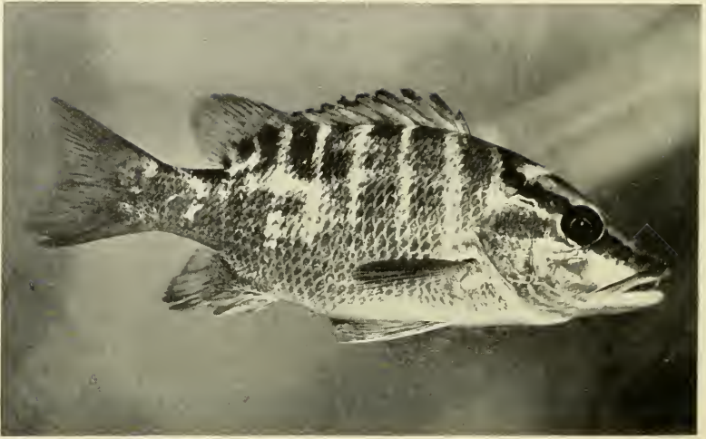
SCHOOLMASTER. Lutianus apodus.