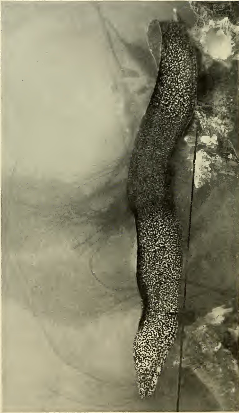
SPOTTED MORAY IN THE NEW YORK AQUARIUM. Lycodontis moringa.