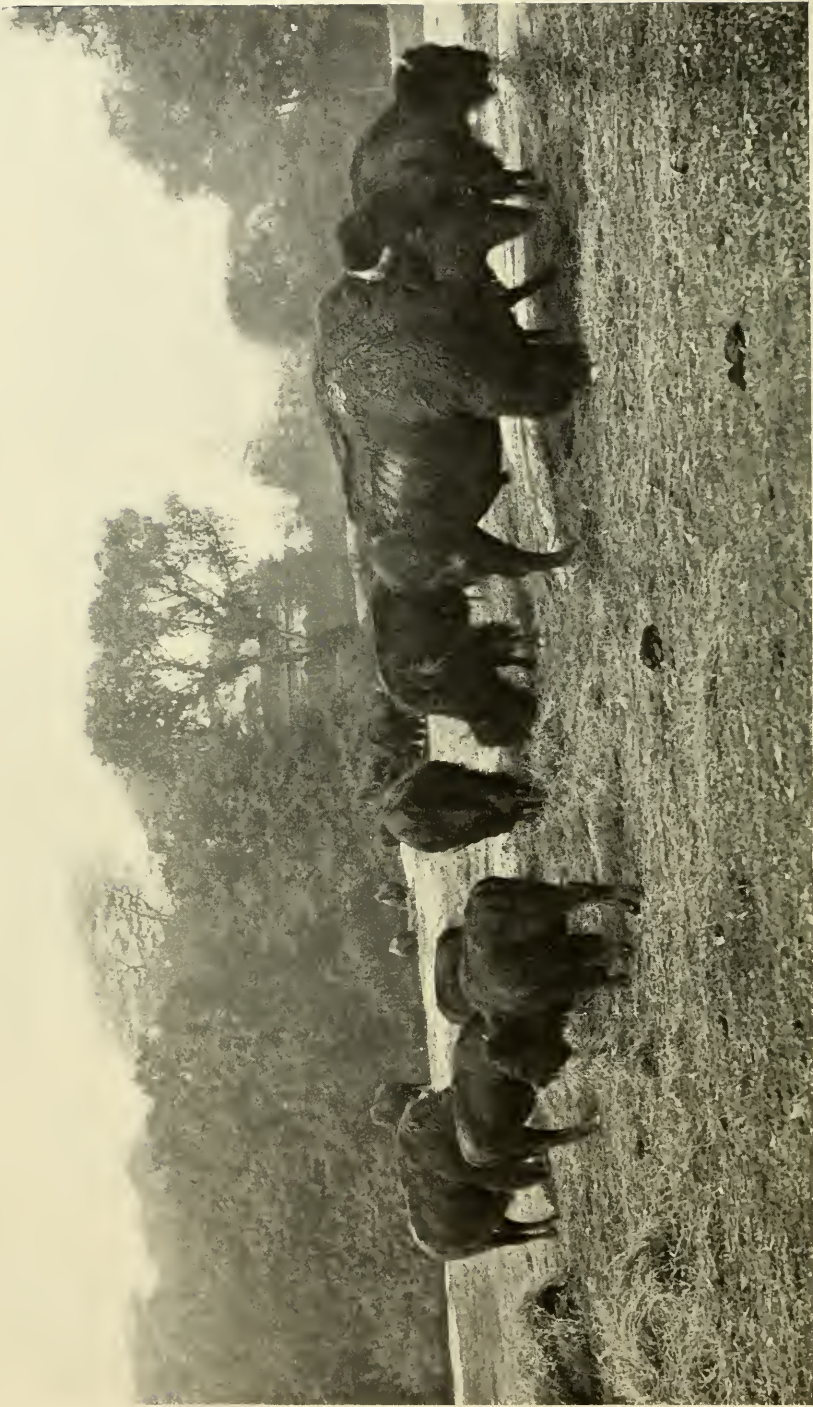
PART OF THE BISON HERD IN THE ZOOLOGICAL PARK. A number of them now form the herd in the Wichita Preserve.