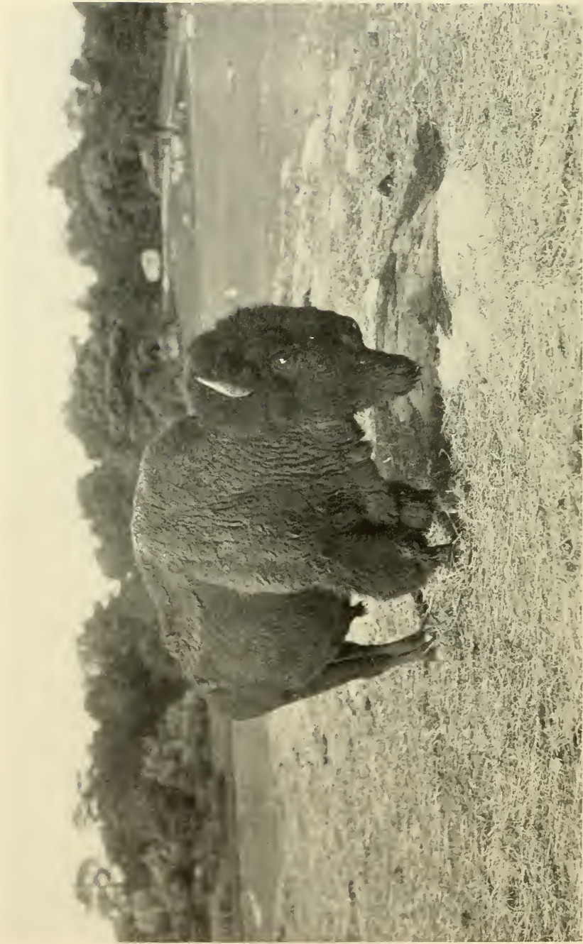
AMERICAN BISON BULL IN THE ZOOLOGICAL PARK.