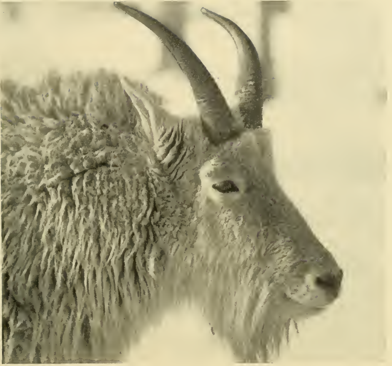
HEAD OF YOUNG MALE ROCKY MOUNTAIN GOAT.