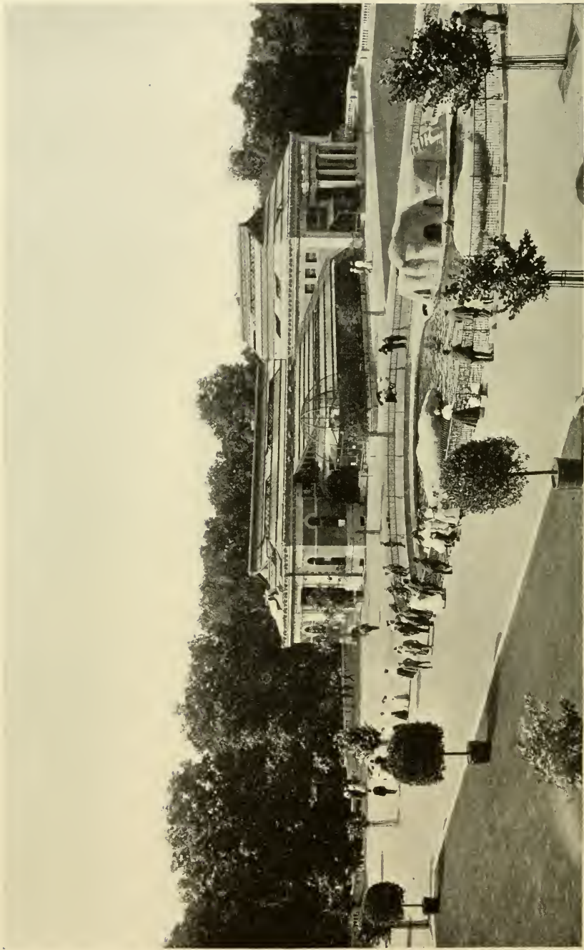
PORTION OF BAIRD COURT.

Showing the new Bird House for perching birds and the Sea-Lion Pool.