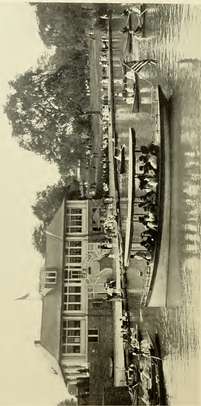
NEW BOAT-HOUSE ON BRONX RIVER. A fleet of Mullins' steel boats and the electric launch "Albatross" are in active service the entire season.