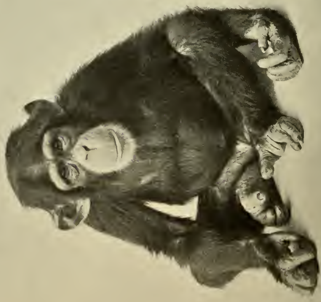
LONG-HAIRED CHIMPANZEE "AUGUST" AND BALD-HEADED CHIMPANZEE "BALDY." Pan satyrus schweinfurthi (Giglioli) Sudan and Uganda.