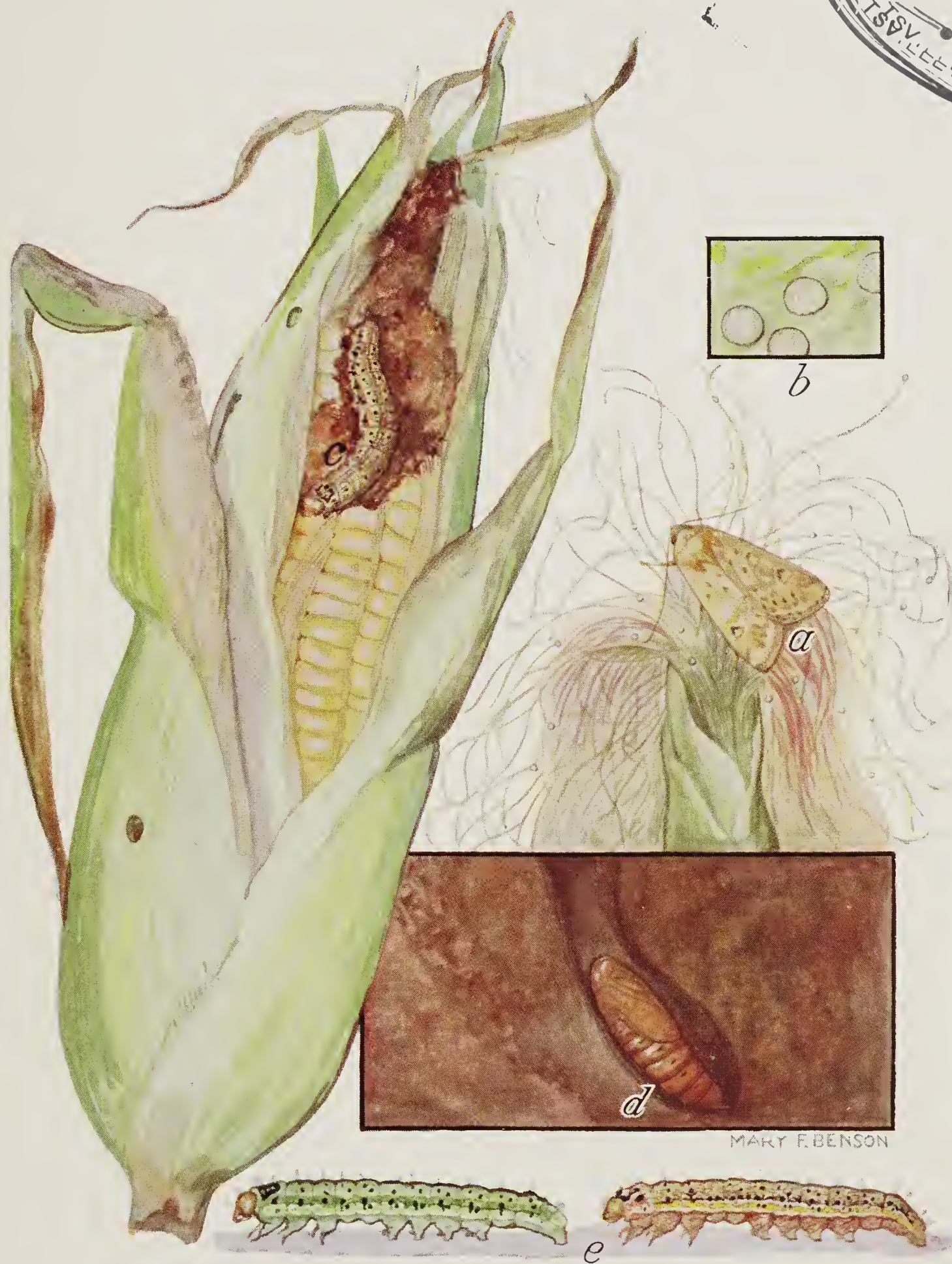
a , Moth (or adult), and eggs on silks; b , eggs; c , earworm feeding in ear of corn; d , pupa in a cell; e , color phases of the earworm. (All except b about 1\frac{1}{3} times natural size; b 5\frac{1}{2} times natural size.)

(See other side for life history and control)