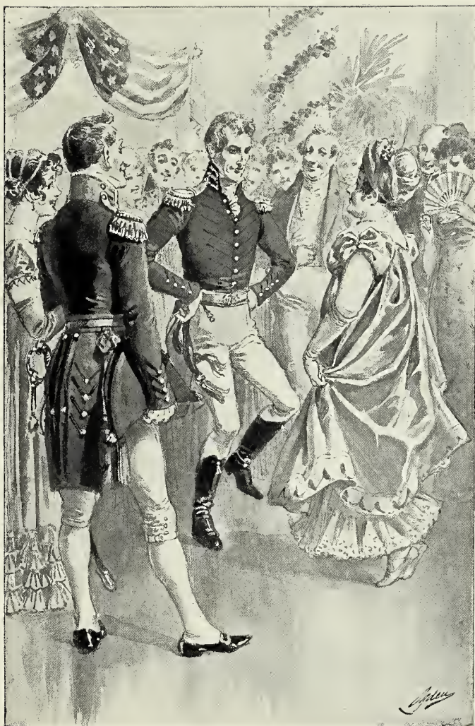
THE HERO AND HIS WIFE WENT THROUGH THEIR FAVORITE REEL TOGETHER.