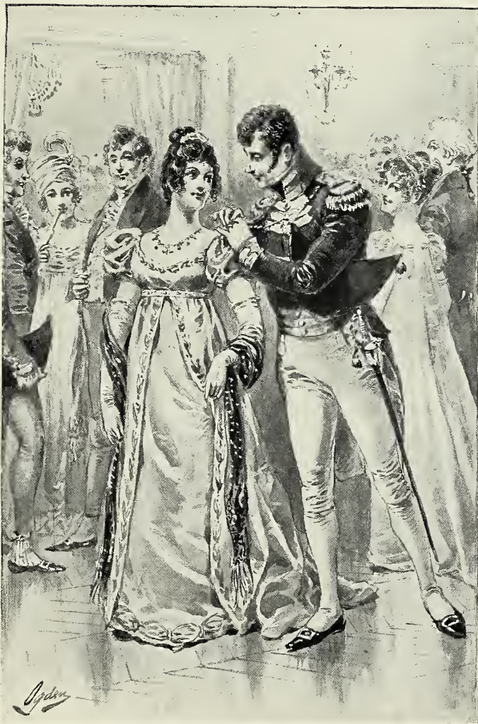
MISS ELIZABETH AND HER ILLUSTRIOUS LOVER MOVED IN AN ENCHANTED WORLD THAT EVENING.