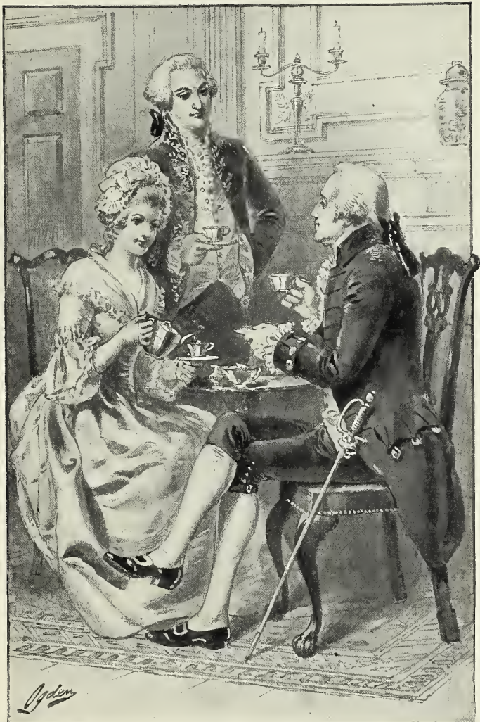
ONE FRENCHMAN SHOWED HIS APPRECIATION BY DRINKING SEVENTEEN CUPS OF TEA.