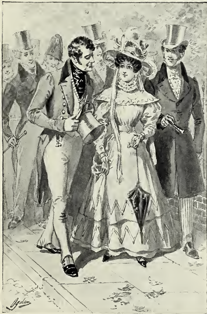
SHE IS SAID TO HAVE WALKED ATTENDED BY "TEN ESCORTS."