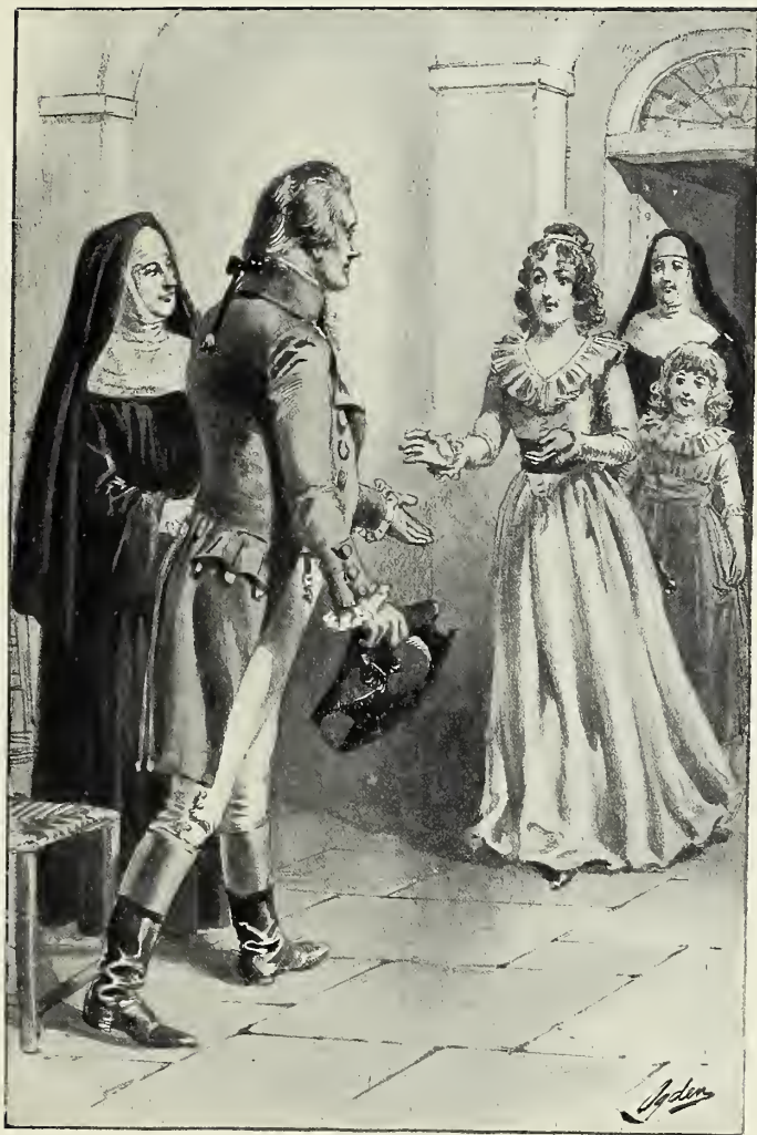
PATSY AND POLLY CAME INTO THE ROOM.