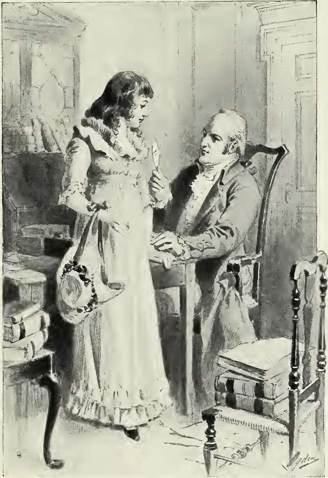
HE LAID HIS HAND CARESSINGLY ON HERS.