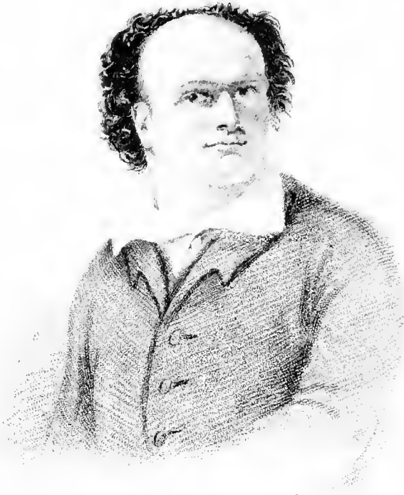
BENJAMIN ROBERT HAYDON