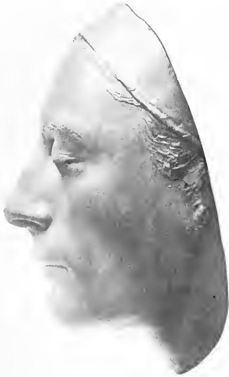
Life-mask of Keats

From an electrotype in the National Portrait Gallery