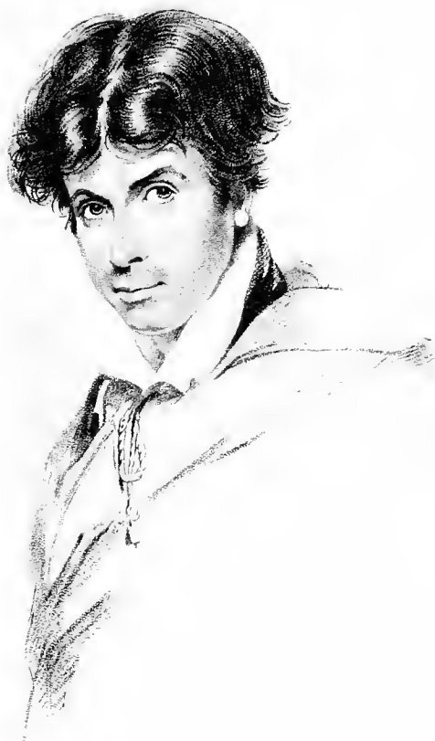
JAMES HENRY LEIGH HUNT