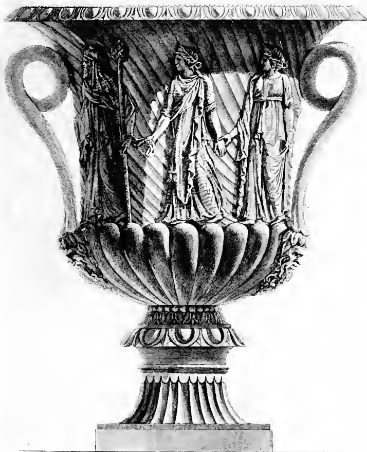
‘Figures on a Greek vase: a man and two women’

FROM AN ETCHING IN PIRANESI’S VASI E CANDELABRI