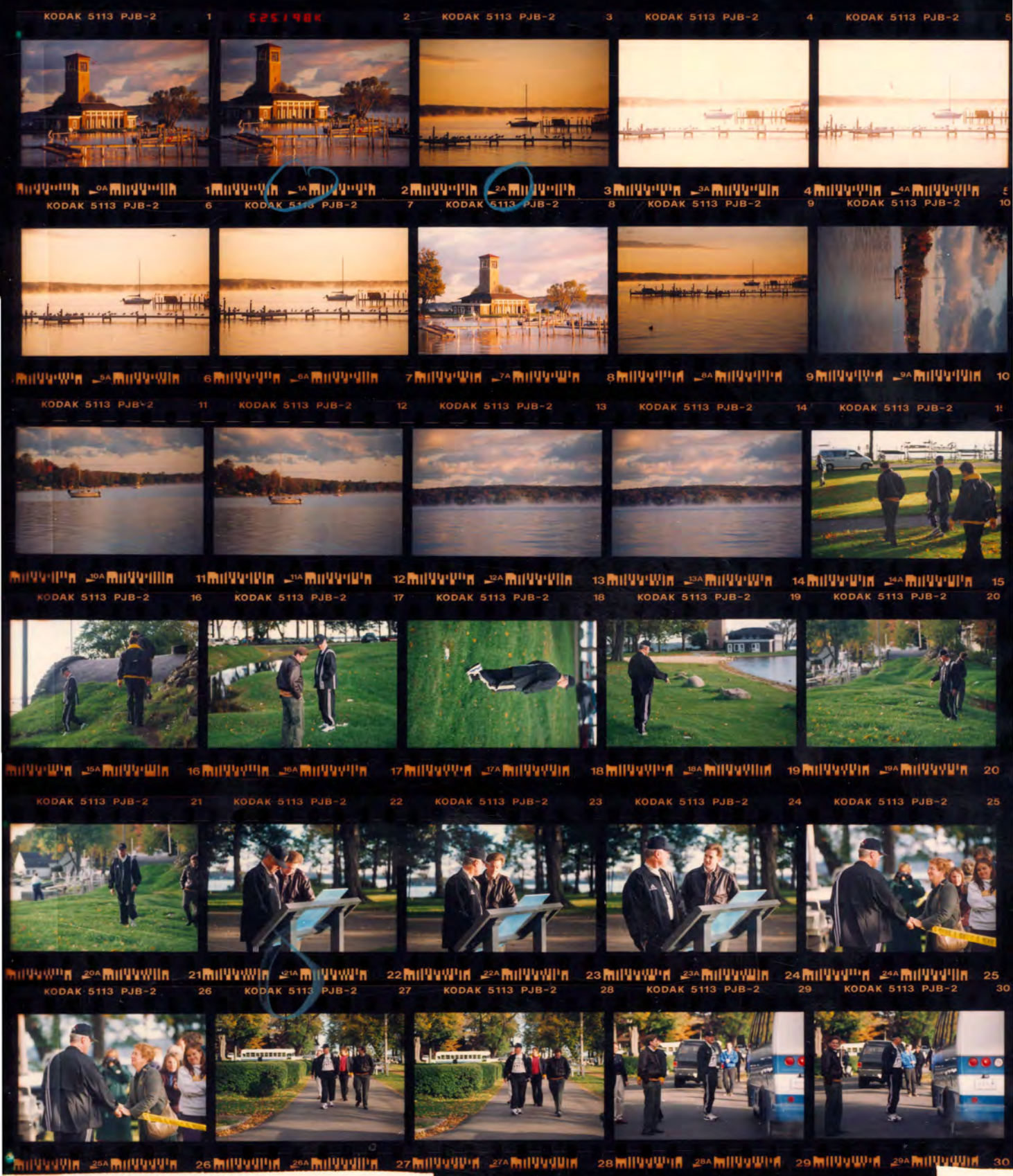
BC walking near the Athenaeum Hotel in Chautauqua, N.Y. With Kirk Hanlin