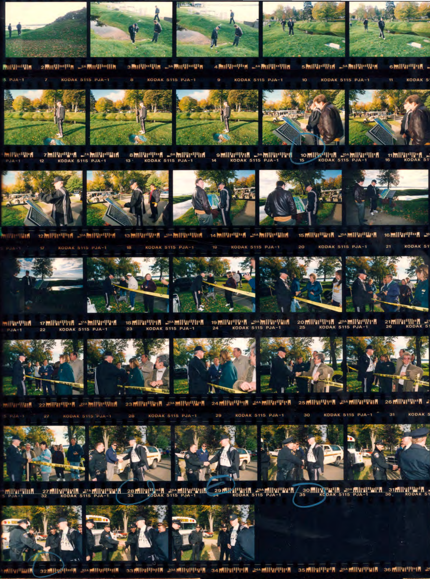
BC walking in Chautauqua, N.Y.