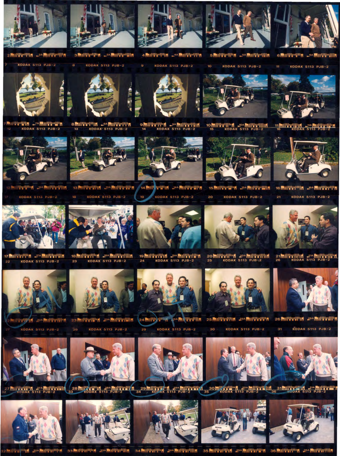
BC and George Mitchell walking out of the Athenaeum Hotel in Chautauqua, N.Y, BC at Lenna Hall for debate prep,