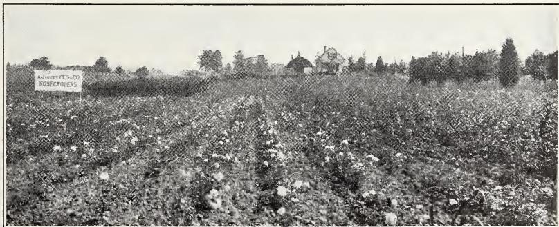
A Block of Roses in Bloom.

All of the Roses listed in this catalogue are tested in our own fields before we offer them for sale, which assures you best varieties of plants for out-door growing.