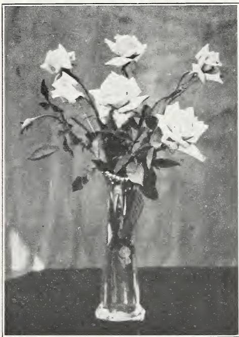
Pink Maman Cochet.

If planted well and protected during winter, this is a very pleasing and satisfactory class of roses.