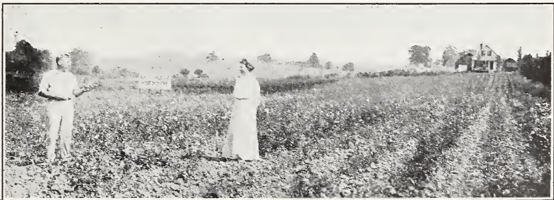
Looking Over the Plants.

Hybrid Tea Roses, Tea Roses, and Polyantha Roses should be cut back 4 or 6 inches above the ground, according to their growing habit. As a general rule all strong growing varieties are pruned about 6 inches above the ground. Slow growing varieties should be pruned about 4 inches above the ground. Hybrid Perpetuals may be cut 8 inches above the place where budded.