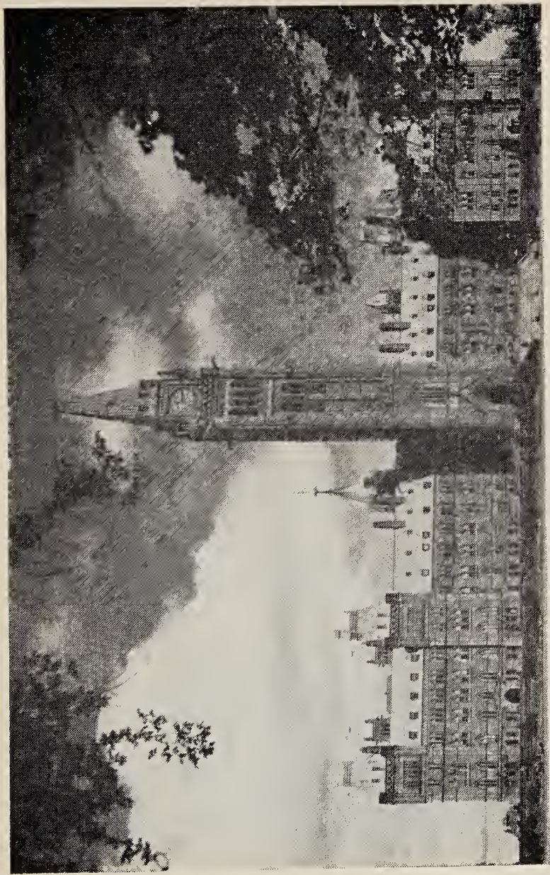
HOUSE OF PARLIAMENT, OTTAWA, ONT.