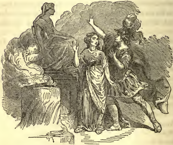
Medea and Jason.