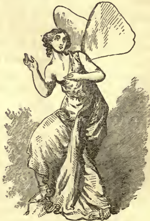
Psyche, in terror of Venus.

Psyche obeyed the commands of Ceres and took her way to the temple of Venus, endeavoring to fortify her mind and ruminating on what she should say and how best propitiate the angry goddess, feeling that the issue was doubtful and perhaps fatal.