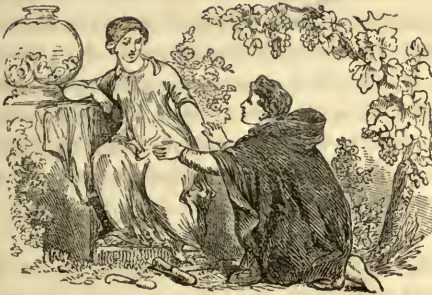
Vertumnus and Pomona.