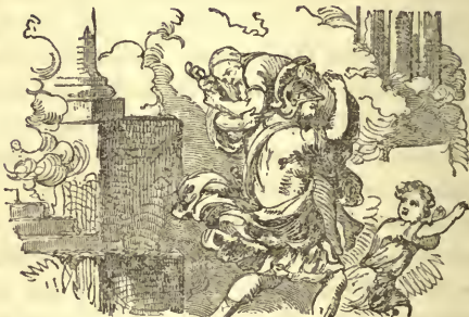
Æneas bearing Anchises from the flames of Troy.