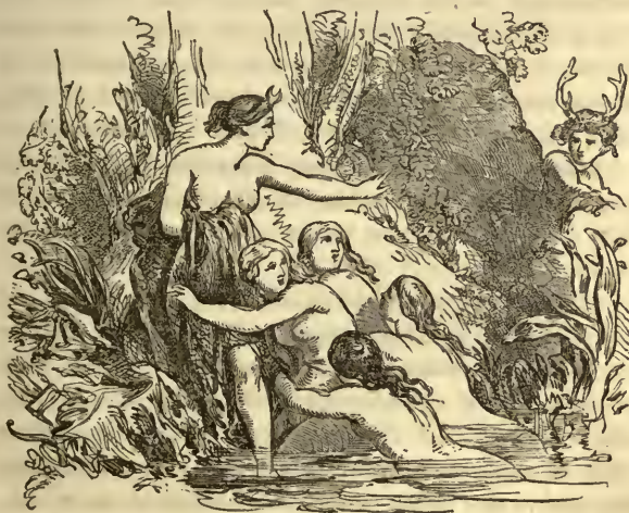
Diana and Actæon.