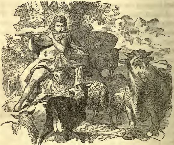
Apollo keeping the flocks of Admetus.

“— That Nyseian isle, Girt with the river Triton, where old Cham, Whom Gentiles Ammon call, and Libyan Jove, Hid Amalthea and her florid son, Young Bacchus, from his stepdame Rhea's eye.”