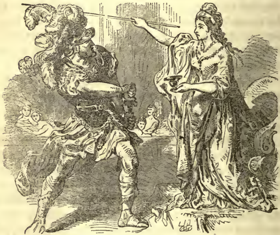
Ulysses and Circe.

Eurylochus hurried back to the ship and told the tale. Ulysses thereupon determined to go himself, and try if by