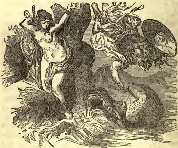
Perseus and Andromeda.

Perseus, continuing his flight, arrived at the country of