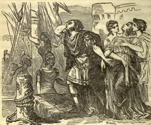
Ceyx and Halcyone.