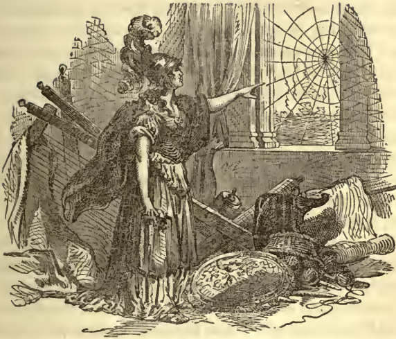
Minerva and Arachne.