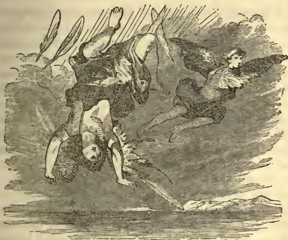
Fall of Icarus.

a gentle curvature like the wings of a bird. Icarus, the boy, stood and looked on, sometimes running to gather up the feathers which the wind had blown away, and then handling the wax and working it over with his fingers, by his play impeding his father in his labors. When at last the work was done, the artist, waving his wings, found himself buoyed upwards and hung suspended, poising himself on the beaten air. He next equipped his son in the same manner, and taught him how to fly, as a bird tempts her young ones from the lofty nest into the air. When all was prepared for flight he said, "Icarus, my son, I charge you to keep at a moderate height, for if you fly too low the damp will clog your wings, and if too high the heat will melt them. Keep near me and you will be safe." While he gave him these instructions and fitted the wings to his shoulders, the face of the father was wet with tears, and his hands trembled. He kissed the boy, not knowing