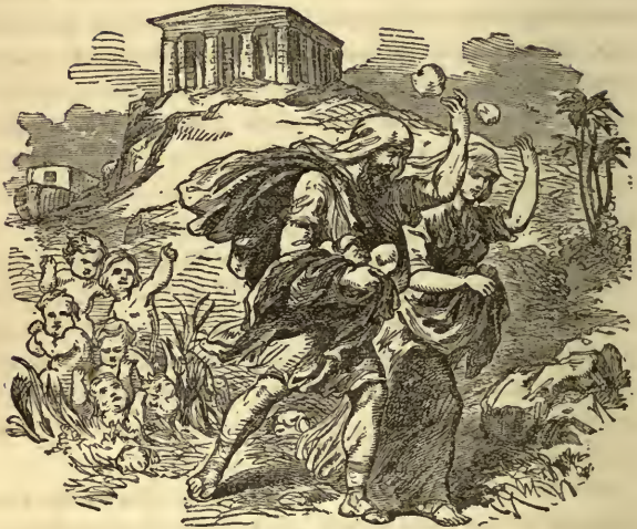
Deucalion and Pyrrha.