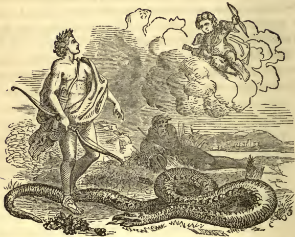
Apollo and Python.