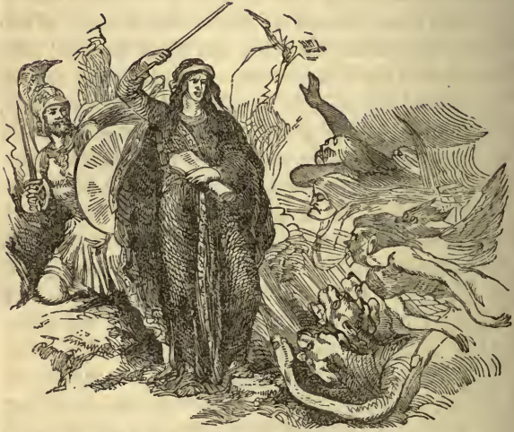
Æneas and the Sibyl at the entrance to the Infernal Regions.