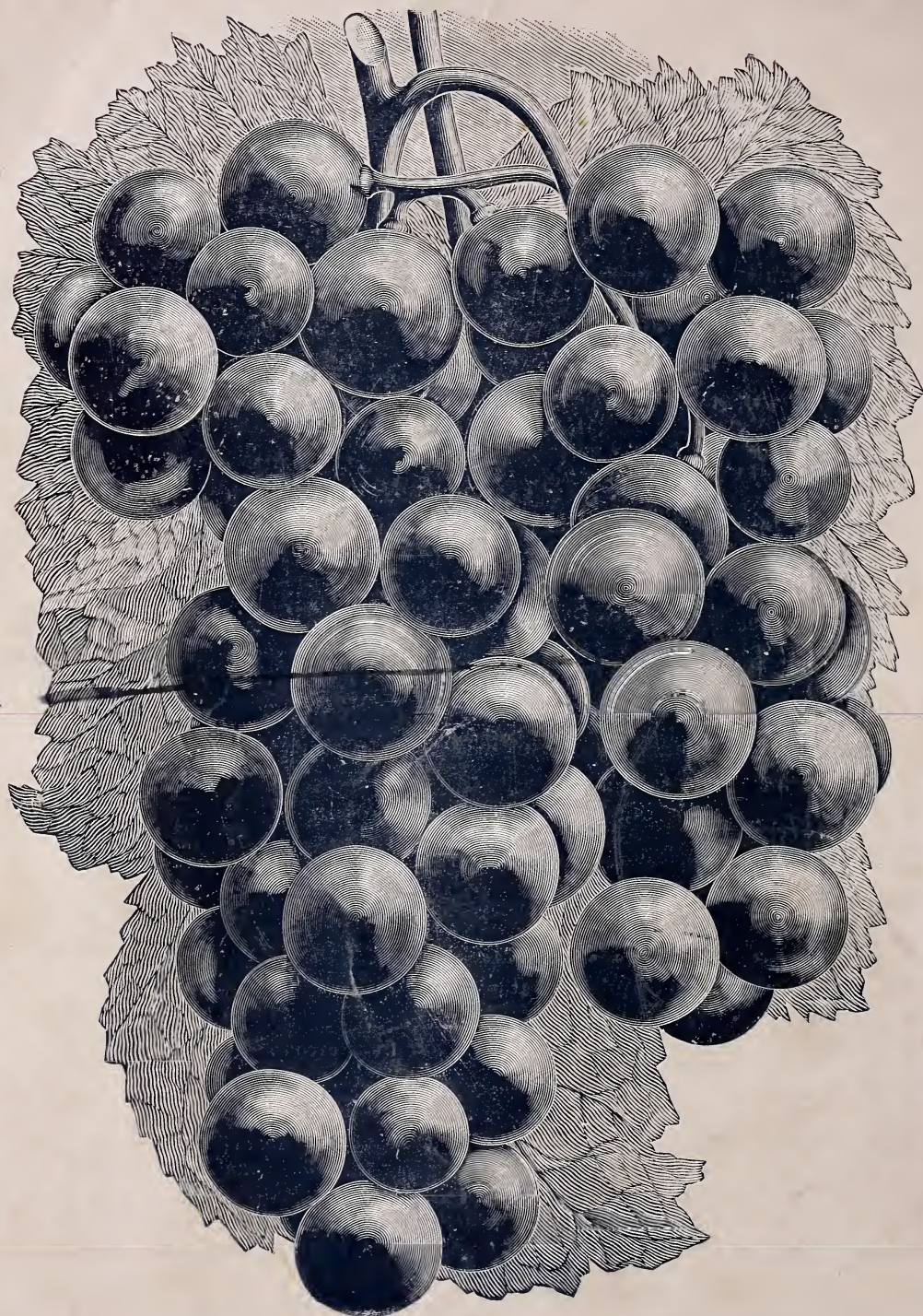
CAMPBELL'S EARLY. PHOTOGRAPHED FROM NATURE; EXACT SIZE.