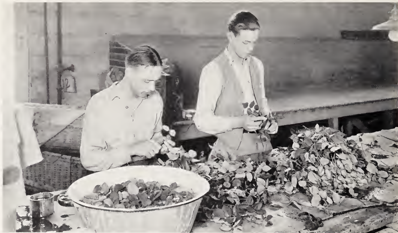
Scions Cut From Flowering Wood. Note Buds on Table at Right.