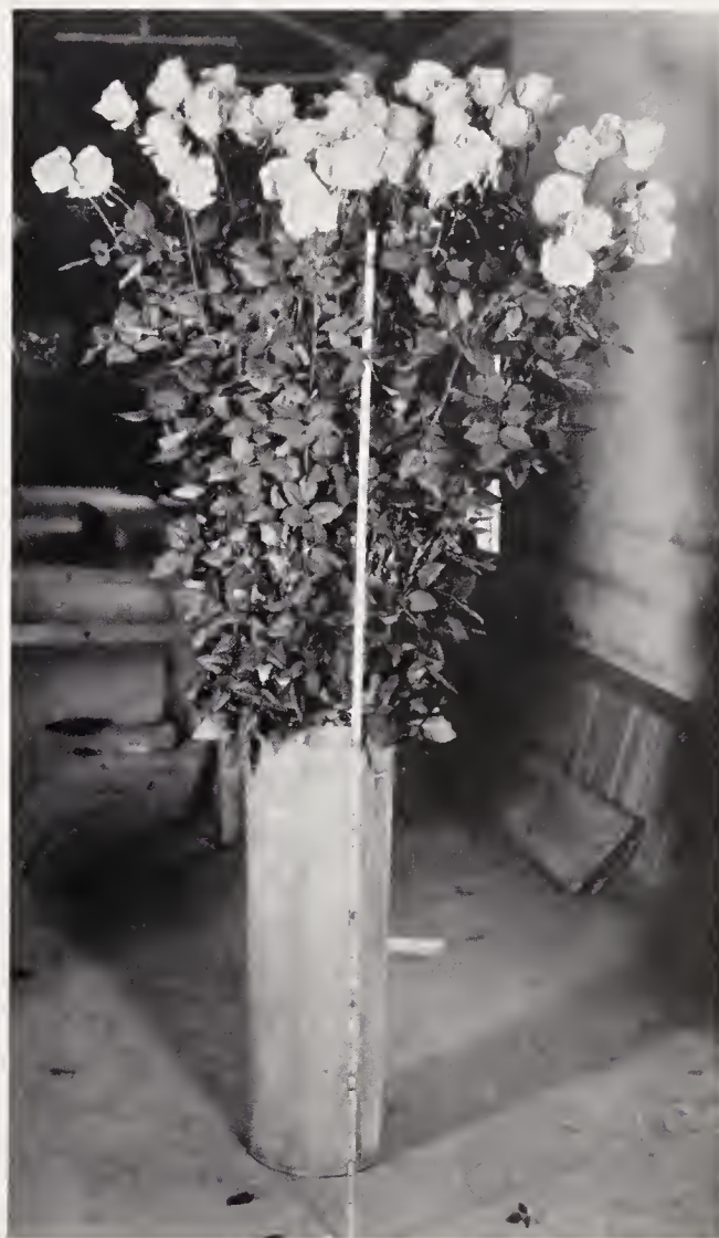
Show Flowers Typical of the Sturdy Growth from Hill's Grafts.

Prices f. o. b. purchaser's point of delivery east of Denver, Colorado.