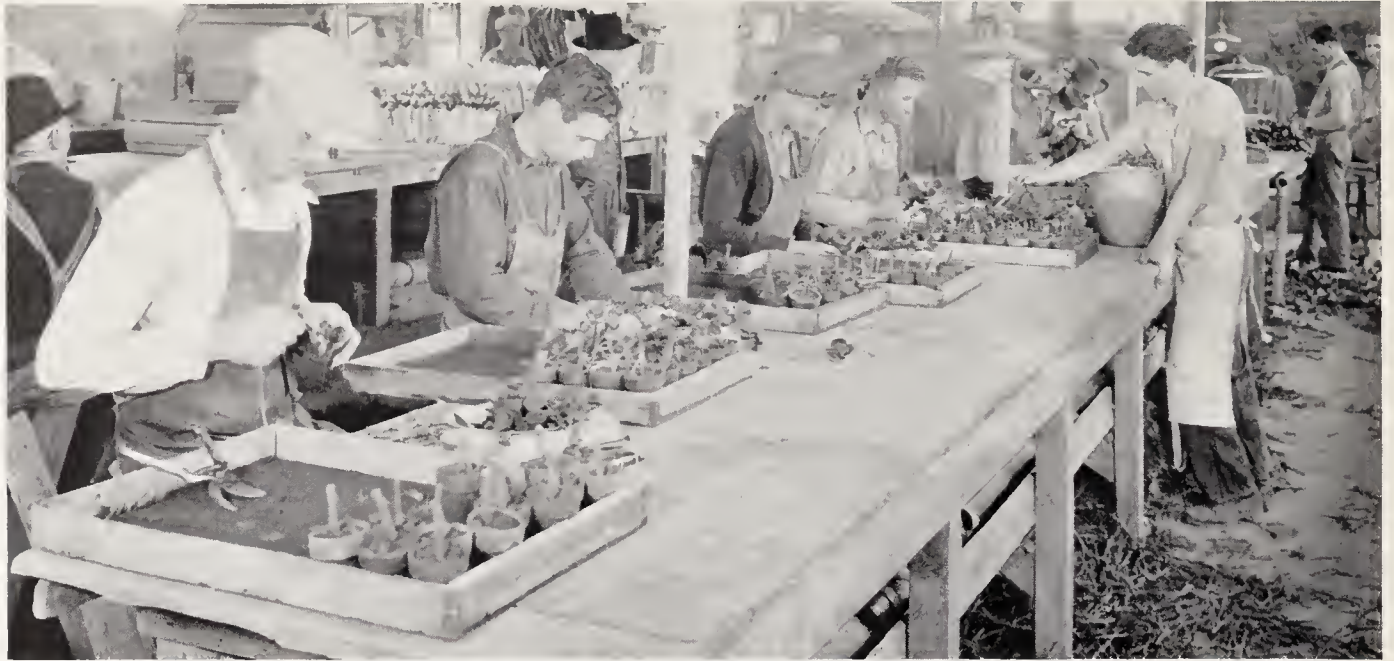
Experienced Grafters Under Careful Supervision.