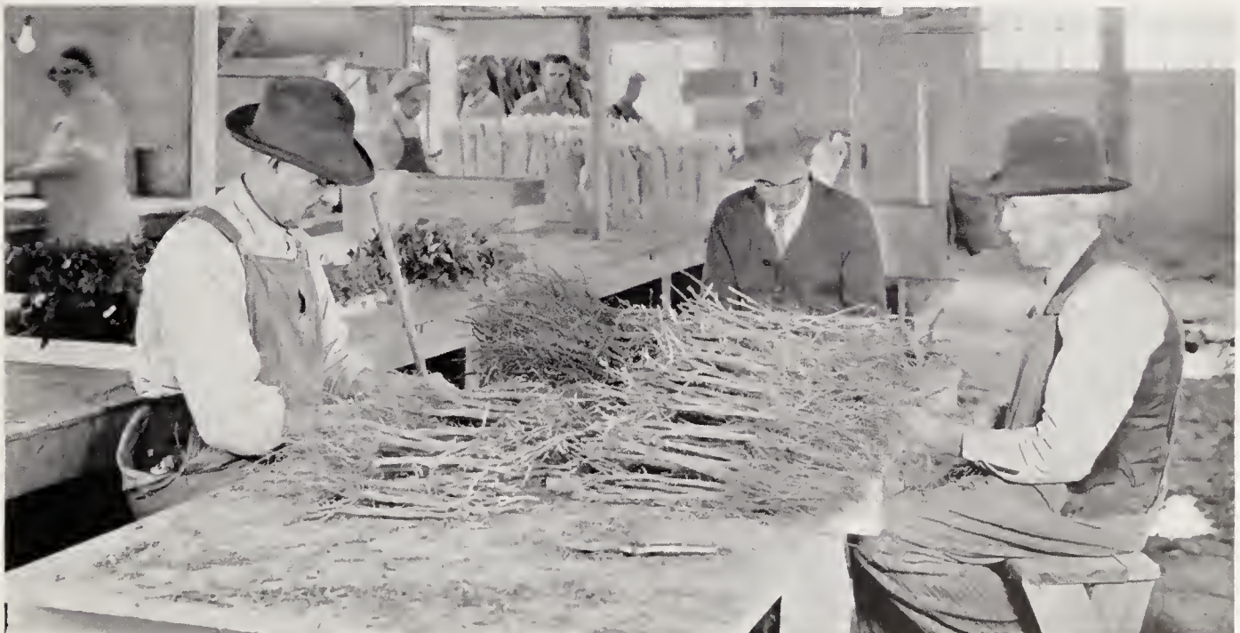
Careful Selection of Manetti Stocks