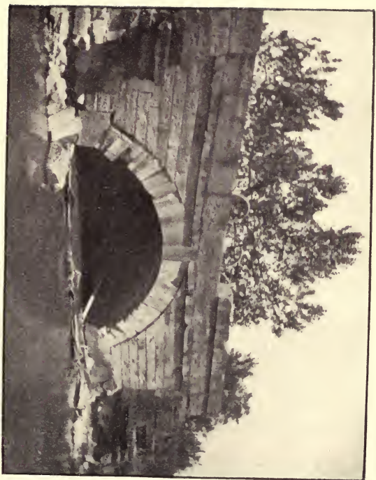
CULVERT ON THE CUMBERLAND ROAD IN OHIO