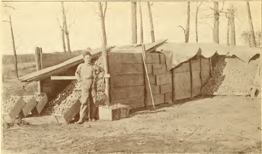
TWENTY-FIVE HUNDRED BUSHELS POTATORS IN BIN, AWAITING SHIPMENT, ON LINE OF ST. L., I. M. & S. R'Y. ARKANSAS. (From a recent Photo.)