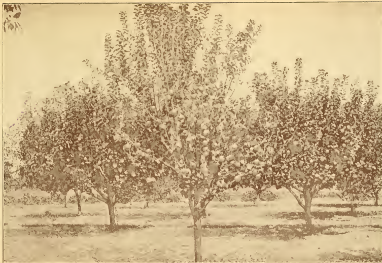
APPLE GROWING IN ARKANSAS. SHANNON APPLE TREES. FIFTH YEAR FROM GRAFT. (From a recent Photo.)