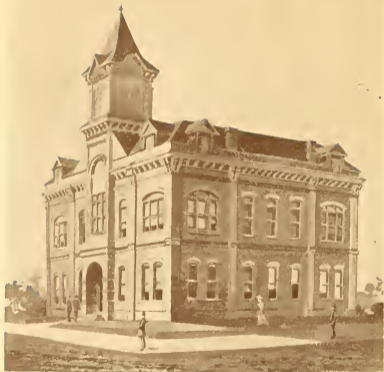
Lawrence County Court House, Powhatan, Ark