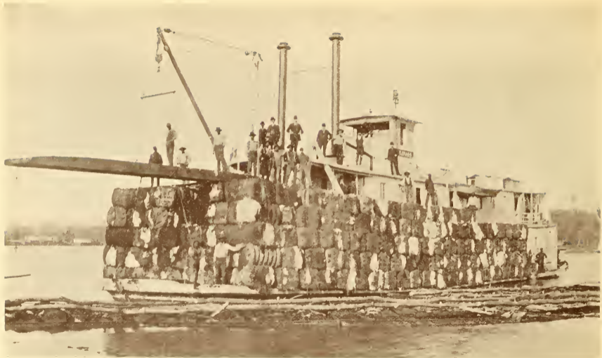
STEAMER BRAGG, RUNNING ON BLACK RIVER, MAKES WEEKLY TRIPS FROM NEWPORT TO THE MISSOURI LINE. (From a recent Photo.)