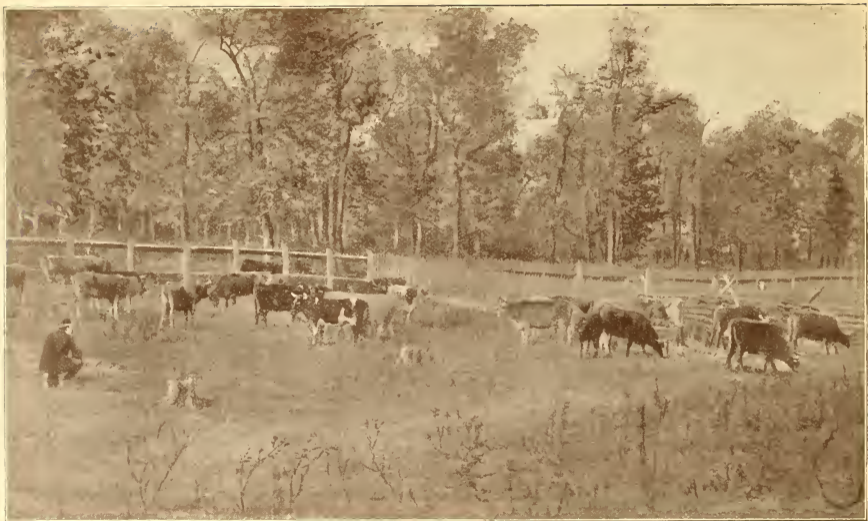
STOCK FARM, ARKANSAS. (From a recent Photo.)