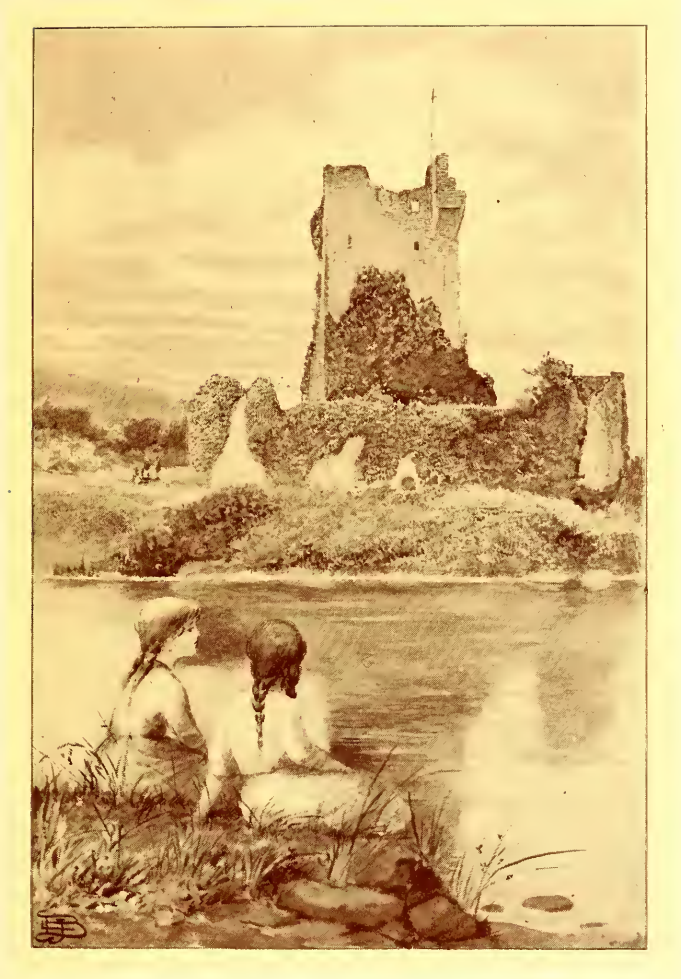
NORAH AND MOLLIE AT LOUGH LEAN.