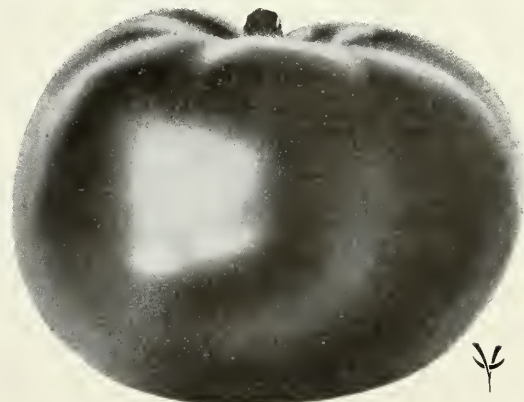
TOMATO, JOHN BAER

PONDEROSA. The Giant Tomato. A leader among the large fruited varieties. The vines are strong in growth, and when pruned to a single stem, the fruit reaches 1 pound in weight; tomatoes grow in beautiful uniform clusters. Price, oz., 50c; ¼ lb., $1.50; lb., $5.00.