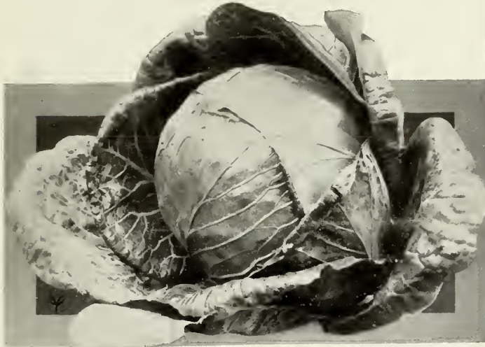
VAUGHAN'S ALL SEASONS

ORDER SEEDS NOW. NONE BETTER THAN VAUGHAN'S