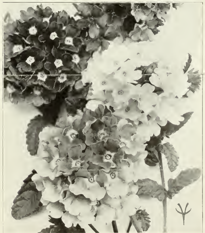
VERBENA—Vaughan's Best Mixed