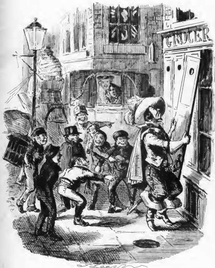
Don Casimiro de Saizua en dificultades