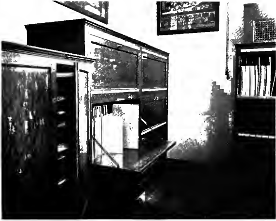
CASES SHOWING STORAGE OF PHOTOGRAPHS