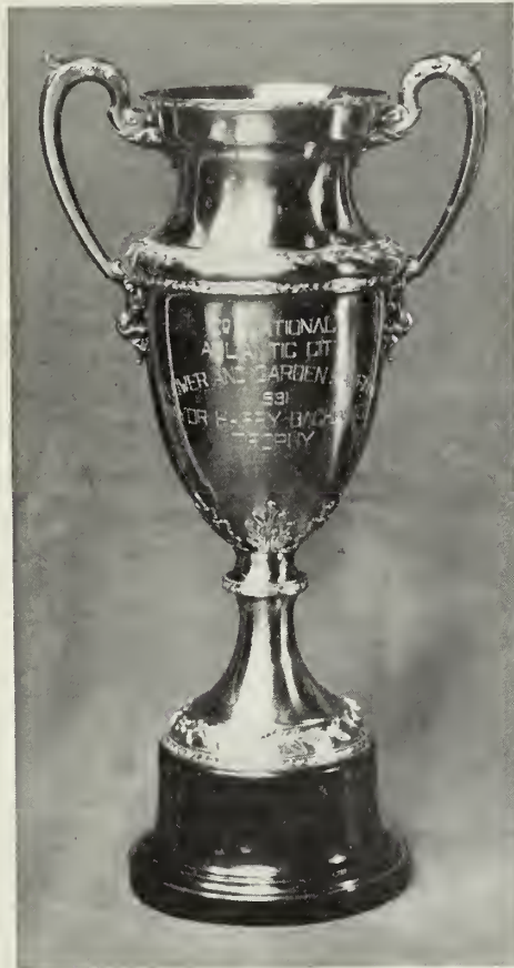
Mayor Bacharach Trophy for best Trade Exhibit covering 600 or more square feet of space.