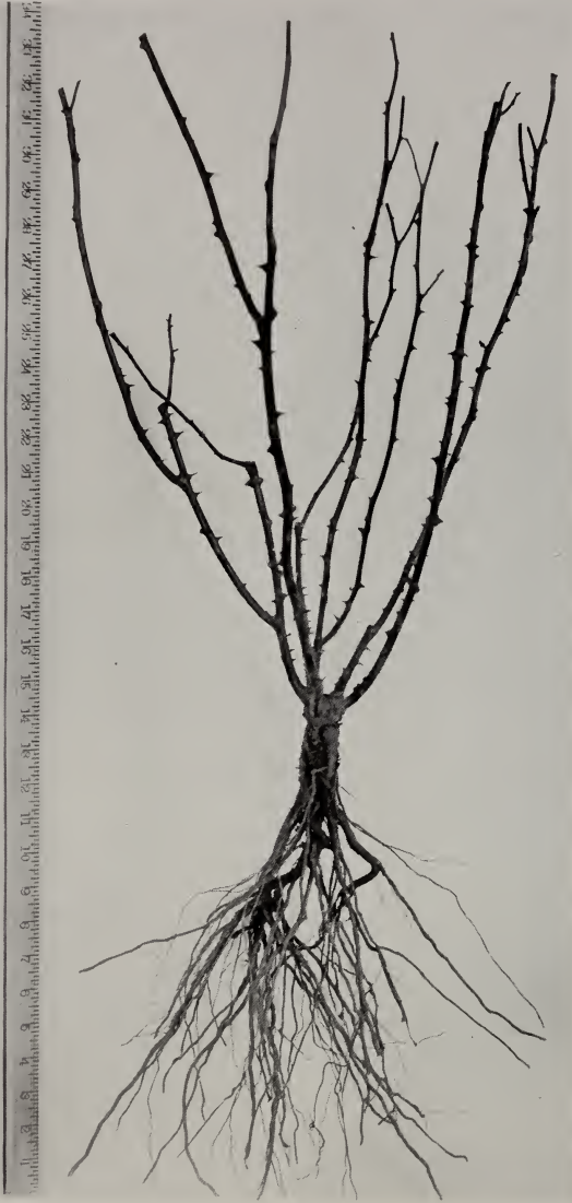
A Dormant Hybrid Tea Rose Bush

(See pages 9 and 11 for pruning directions)