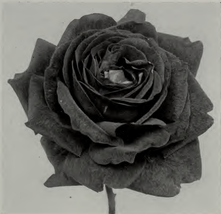
Prince Camille de Rohan (See page 23)

looking toward the better control or eradication of this disease are now being conducted by government experts.