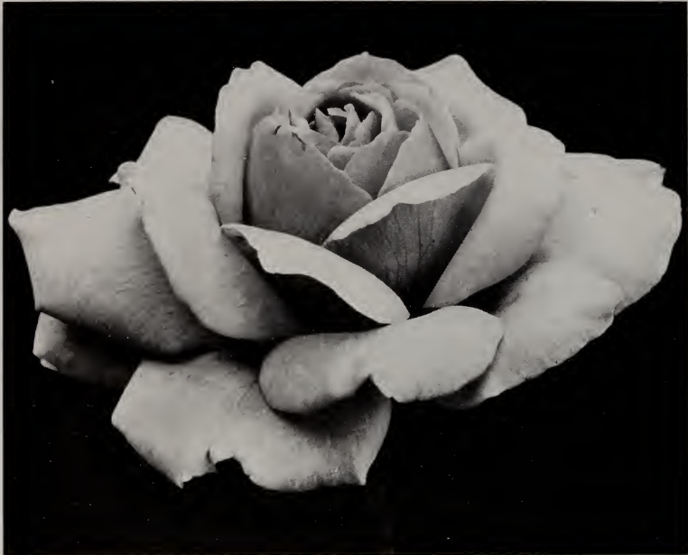
Lady Pirrie (See page 27)

There is usually a period of about five weeks during which planting may be done, but the degree of success attained with the first crop of blooms (within two months from planting) will depend upon how near to the beginning of this period your planting was done. The first flowers of a late planting will be comparatively small and the stems short and weak, as the growths have not had proper time to develop. If, from necessity, planting is deferred until late, the plants should be watered occasionally and shaded until growth is well started.