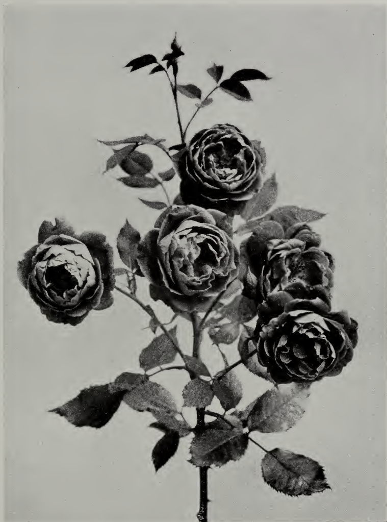
Gruss an Teplitz (See page 26)

MRS. AARON WARD (moderate). Pernet-Ducher, 1907. Indian yellow, variable in color, edging to white. Flowers medium to fairly large, full and perfect cupped form, borne profusely and continuously on rigid upright stems. Very good foliage. Growth moderately vigorous, but bushy. This is a rose of unusual individuality and charm and of which I cannot speak too highly—a rose to love. For table decoration it is simply incomparable. 2-year, 50c.; 3-year, 75c.