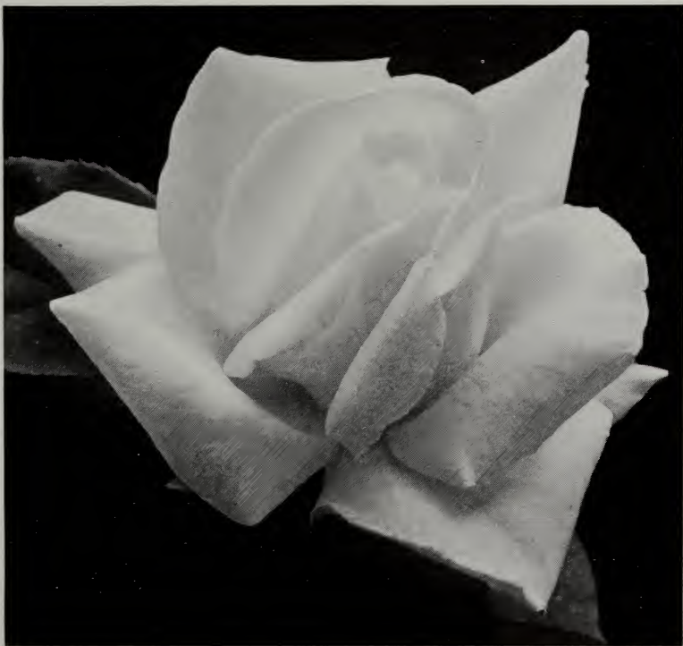
Frau Karl Druschki (See page 21)

Where two-year-old roses are wanted in the Fall, not less than three plants of each variety wanted must be ordered, since at that time of the year each order must be dug separately and this necessitates two men and a boy going over various fields and at a season of the year when we are pressed to the utmost to get our stock all dug and under cover before the ground freezes. Later on, during the Winter, we arrange all our stock alphabetically in the ground under cover, and it is then a simple matter to select orders for Spring filling. This limitation does not apply, however, to three-year-old or Epoch roses, since in the Fall, as well as Spring, we fill orders for these for one or more of a kind as wanted.