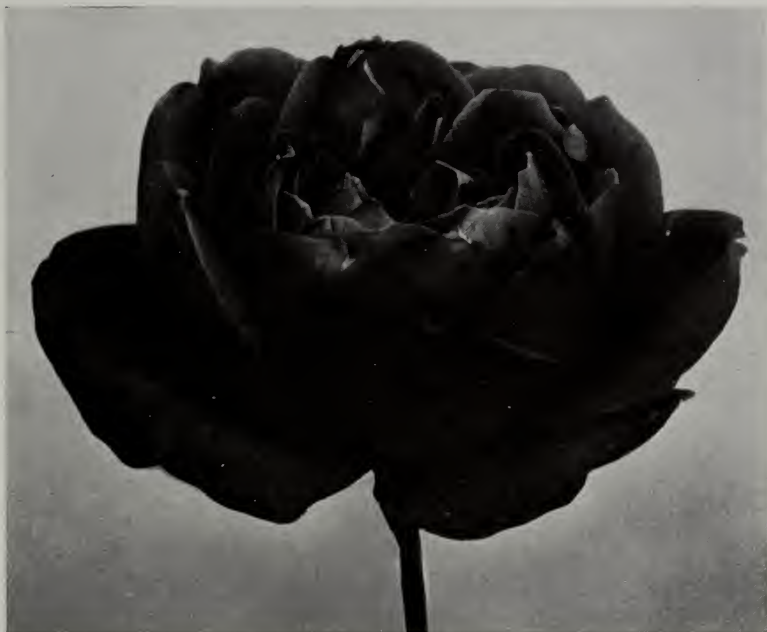
Etoile de France (See page 24)

The roots of our roses sent out in the Spring are puddled in clay mud before packing. Should this be dry on receipt it would be well to repuddle the roots, or at least dip them into water.