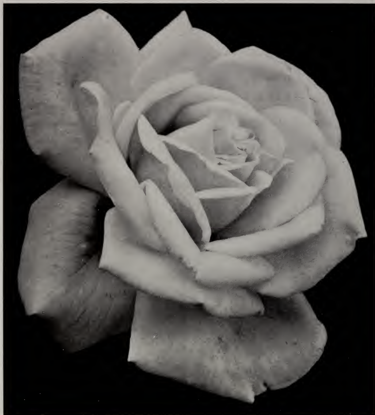
Grace Molyneux (See page 26)