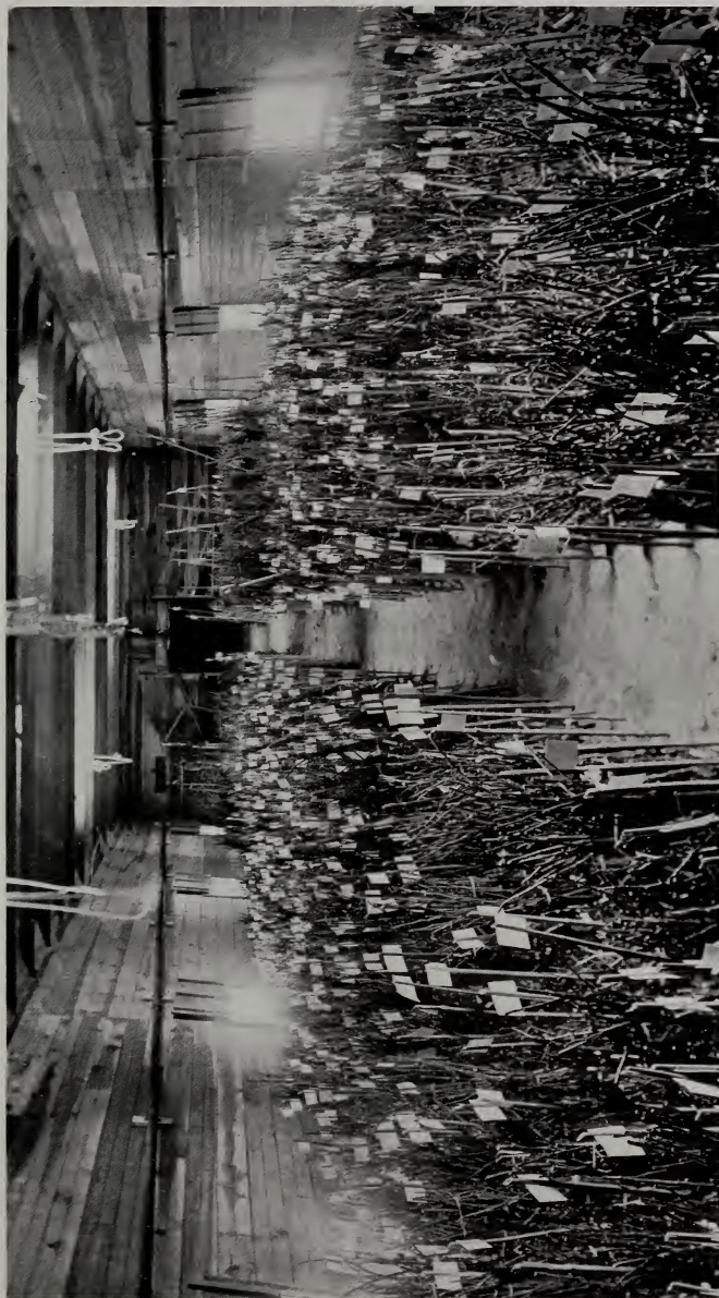
This illustrates how your order is kept from the time it is selected until the day it is shipped. This particular building houses the smaller orders, which are kept in numerical order and can be located immediately when wanted for shipment.