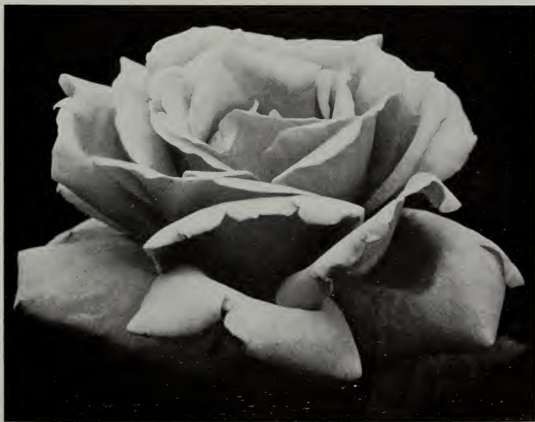
Farbenkonigin (See page 24)

The surest method where the Winters are extremely rigorous is to dig up the plants before the ground freezes, lay them flat in a two-foot trench in well-drained soil and cover with the soil taken out. In early Spring, as soon as the ground is fit to work, dig up and replant. Tender roses may also be Wintered in boxes of soil in a cold cellar, or heeled in, in the floor (if of earth) itself. But two or three waterings will be required during the Winter, just sufficient to prevent drying out.